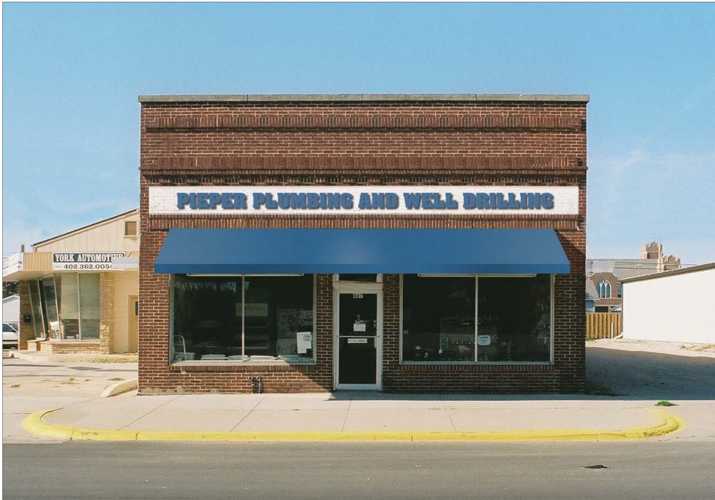
Image 3. Option 2. The existing metal canopy and signage are removed. A single awning with Sunbrella's "Pacific Blue" fabric (#4601) spans the two display windows and the entrance. The new signage is sized to fit in the recessed area above the windows. The lettering, in "Aardvark Bold" font, may be individual raised letters mounted on a signboard (preferred), vinyl letters affixed to a signboard, or letters painted on a signboard.