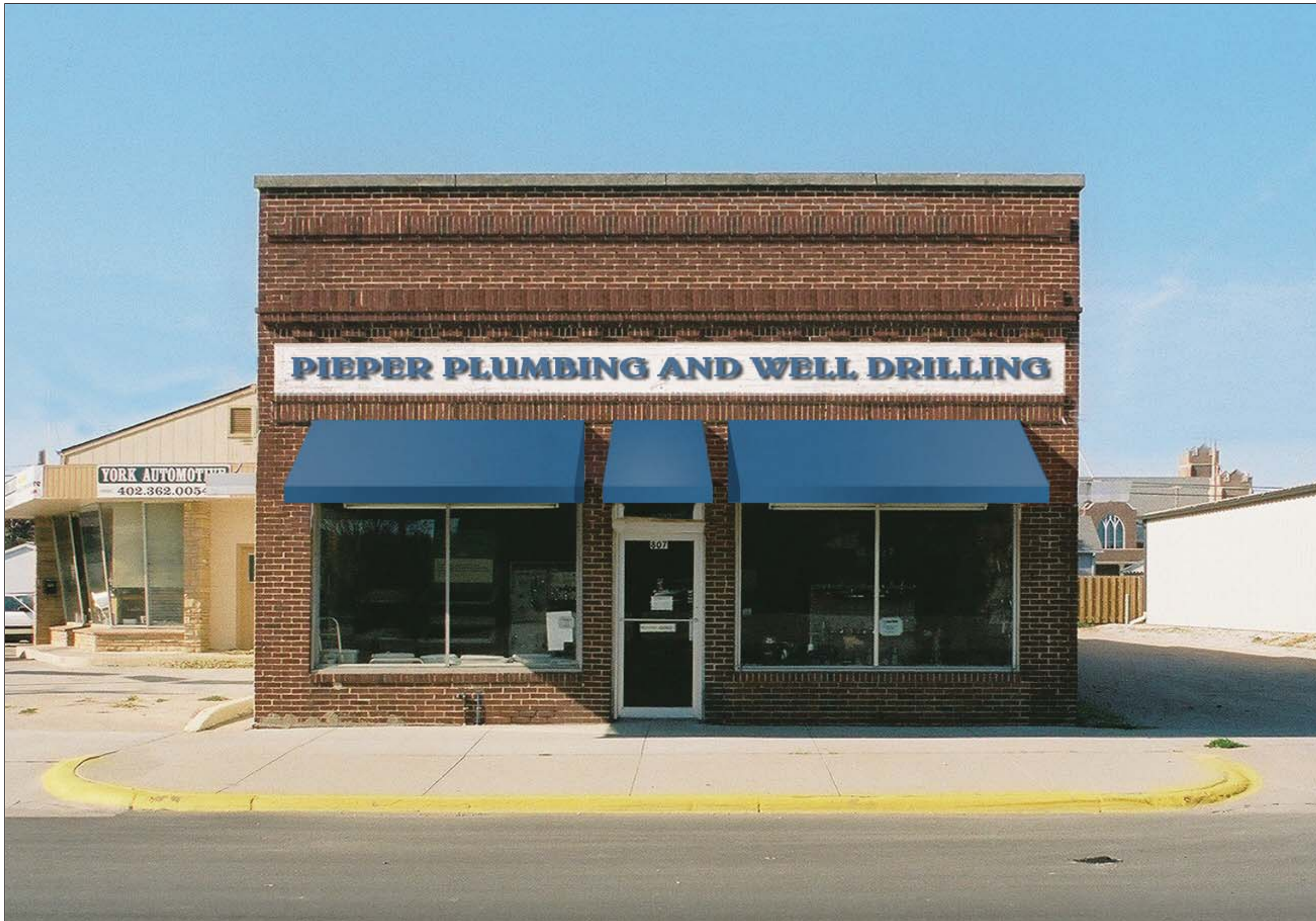
Image 2. Option 1. The existing metal canopy and signage are removed. Three awnings with Sunbrella's "Pacific Blue" fabric (#4601) separately demarcate the two display windows and the entrance. The new signage is sized to fit in the recessed area above the windows. The lettering, in "Blew Extended" font, may be individual raised letters mounted on a signboard (preferred), vinyl letters affixed to a signboard, or letters painted on a signboard.