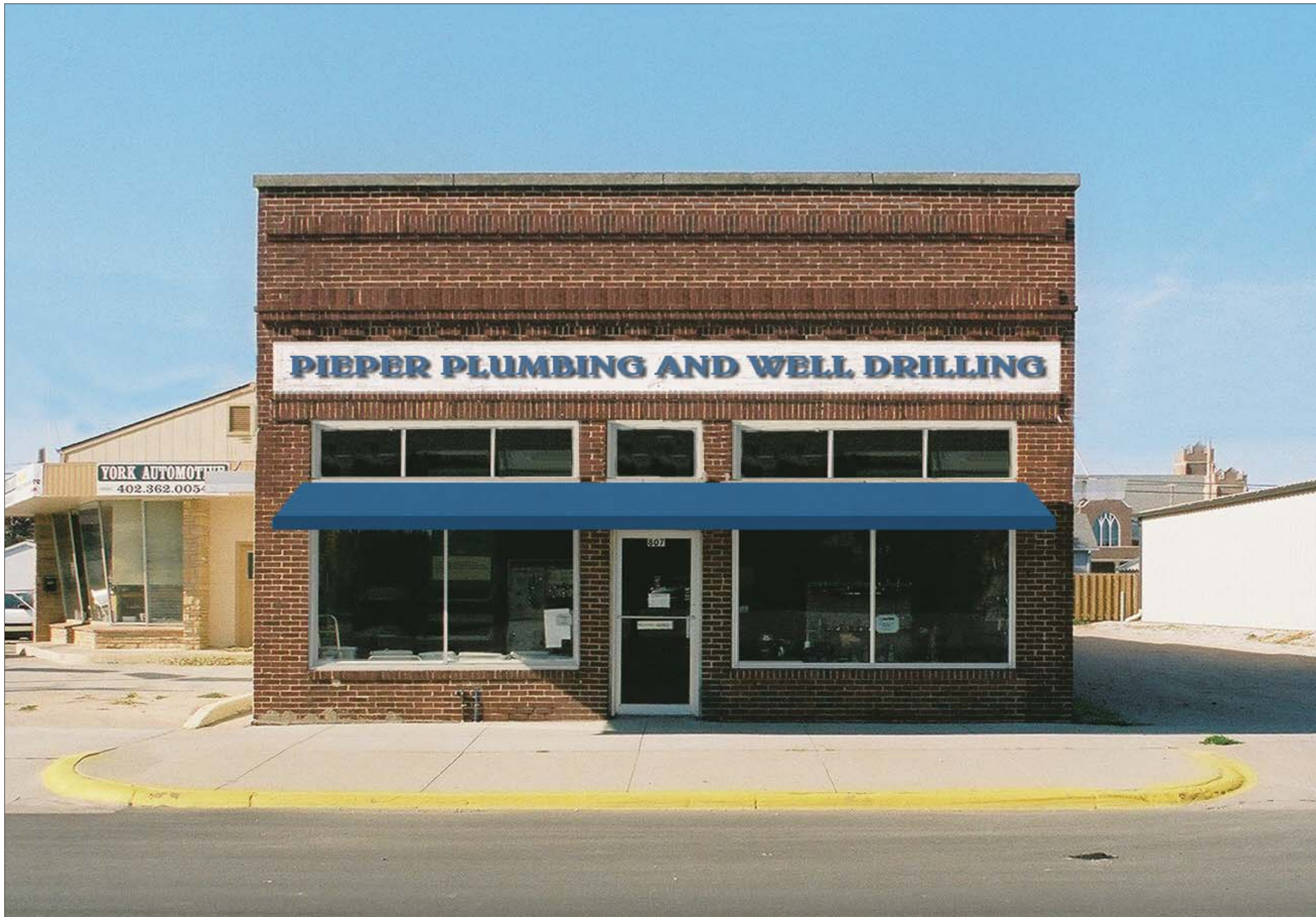
Image 4. Option 3. The existing metal canopy and signage are removed. A single Sunbrella rollout awning with Sunbrella's "Pacific Blue" fabric (#4601) spans the two display windows and the entrance. The transom windows are restored. The new signage is sized to fit in the recessed area above the windows. The lettering, in "Blew Extended" font, may be individual raised letters mounted on a signboard (preferred), vinyl letters affixed to a signboard, or letters painted on a signboard.