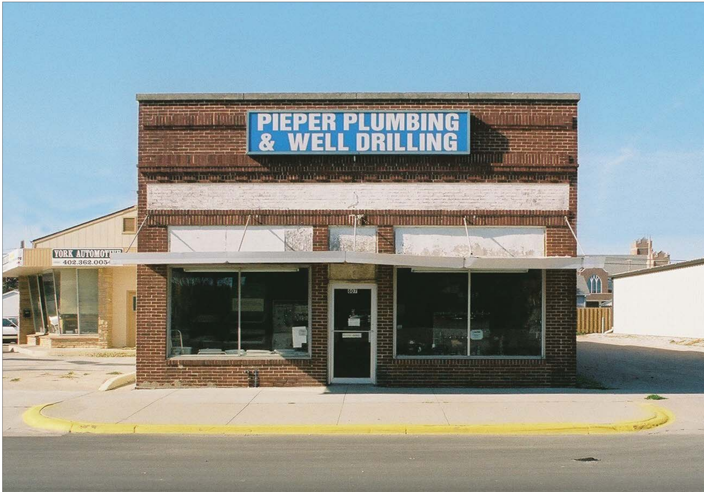
Image 1. Existing Condition. The building currently occupied by Pieper Plumbing and Well Drilling is a handsome 1920s-era commercial building with a symmetrical storefront. The entrance is flanked by two large display windows. This freestanding building, sited flush against the front property line, has a well-crafted brick façade that is still largely in its original condition. Three protruding soldier courses spanning the entire width of the building subdivide the brickwork on the upper façade. A metal canopy spans the width of the façade. Several years ago, the transom windows that existed above the two display windows and the entry door were infilled with panels that were painted white. These panels are now unattractive due to weathering and peeling paint. An elongated rectangular area recessed in the brickwork directly above the transom windows also was painted white in the past.