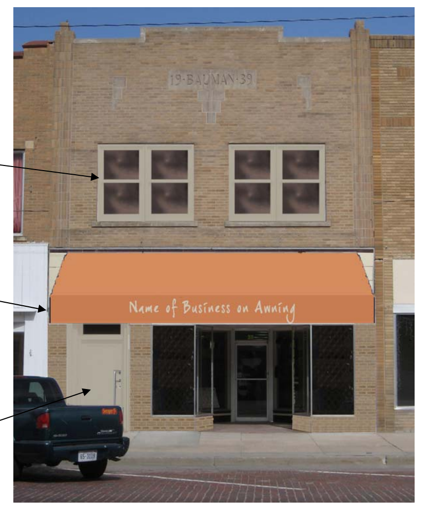
Proposed Design #2