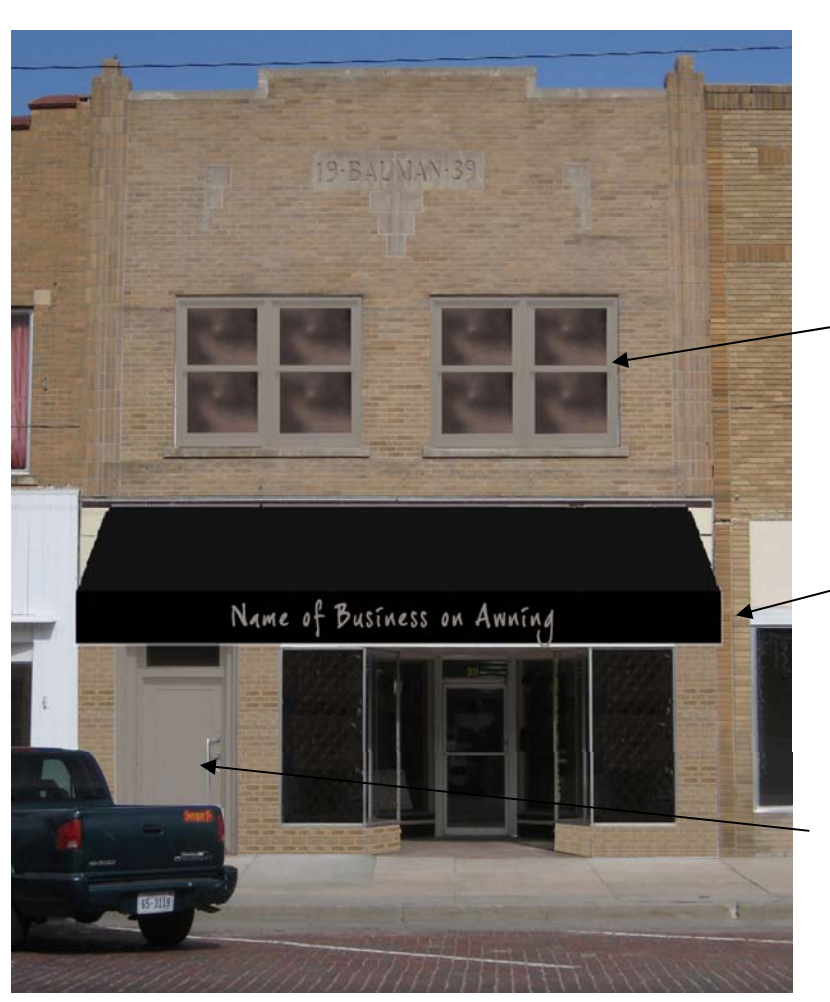
Proposed Design #1

Repair Upper Floor Windows and Repaint; Utilize Interior Storms for Energy Efficiency