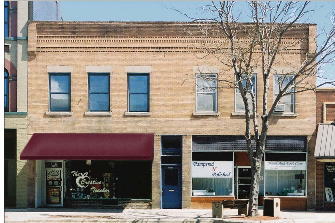
Image 18. Option 3.3: A full-width fixed awning is installed above the storefront door and display window, shielding the transom windows. Vinyl signage is appliquéd to the storefront window. New bronze-colored metal double hung windows are installed on the second story.