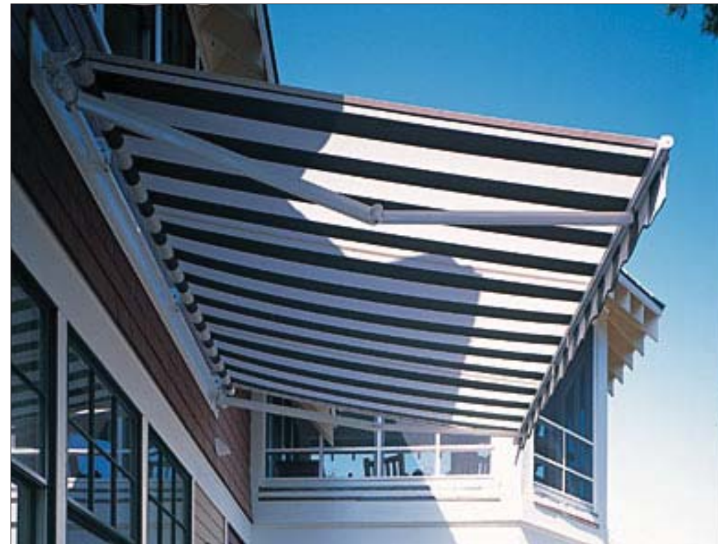
Image 3. Retractable Awning: This example installation of a retractable awning—proposed in the design options presented on the following sheets—illustrates the extended position of the awning, as well as the typical mounting condition of the awning on the façade.