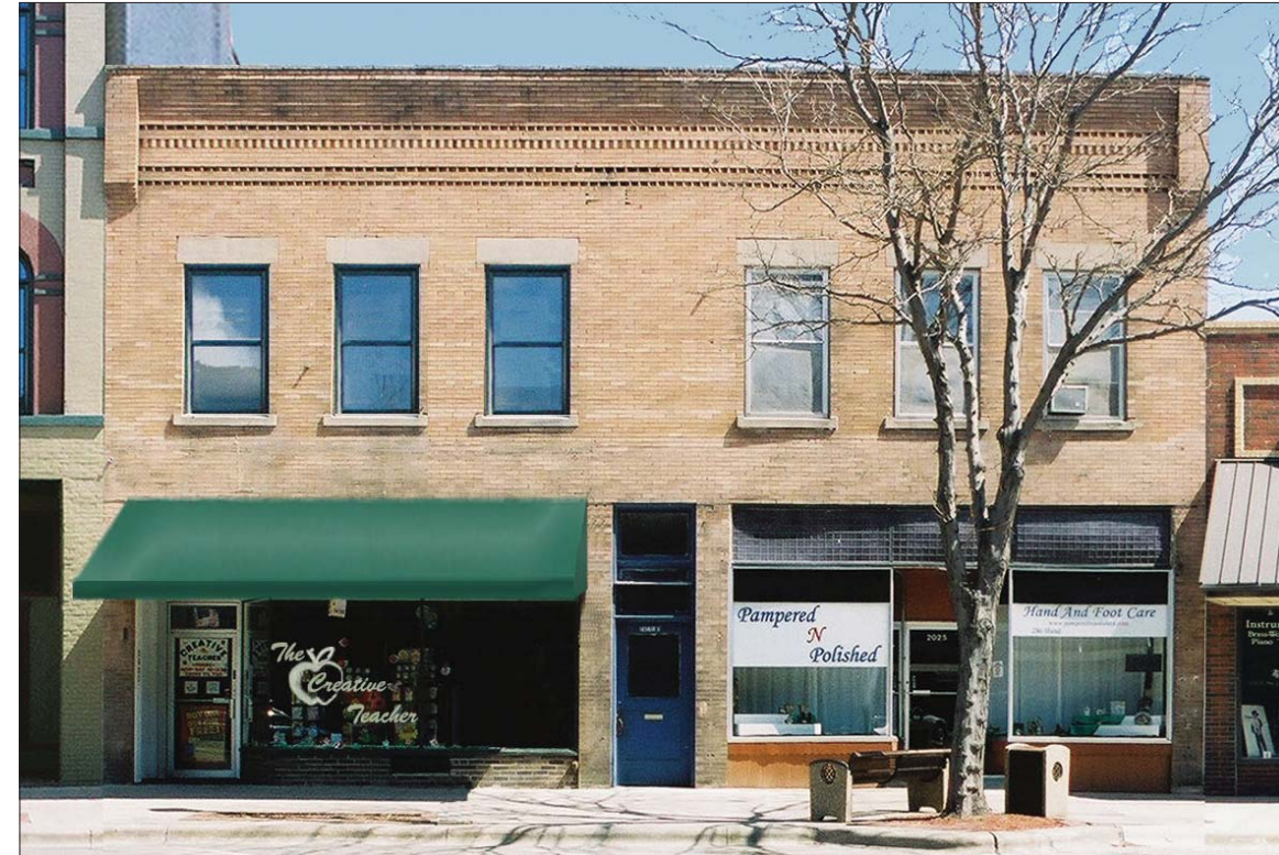
Image 8. Option 1.3: A full-width fixed awning is installed above the storefront door and display window, shielding the transom windows. Vinyl signage is appliquéed to the storefront window. New bronze-colored metal double hung windows are installed on the second story.