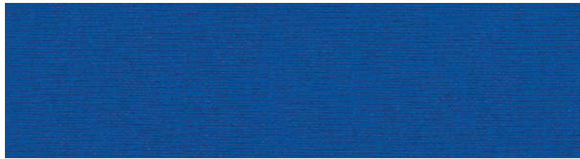
Image 19. Awning Fabric Sample: The fabric used for awnings depicted in Options 4.1 through 4.3 is Sunbrella's "Ocean Blue" (#4679).