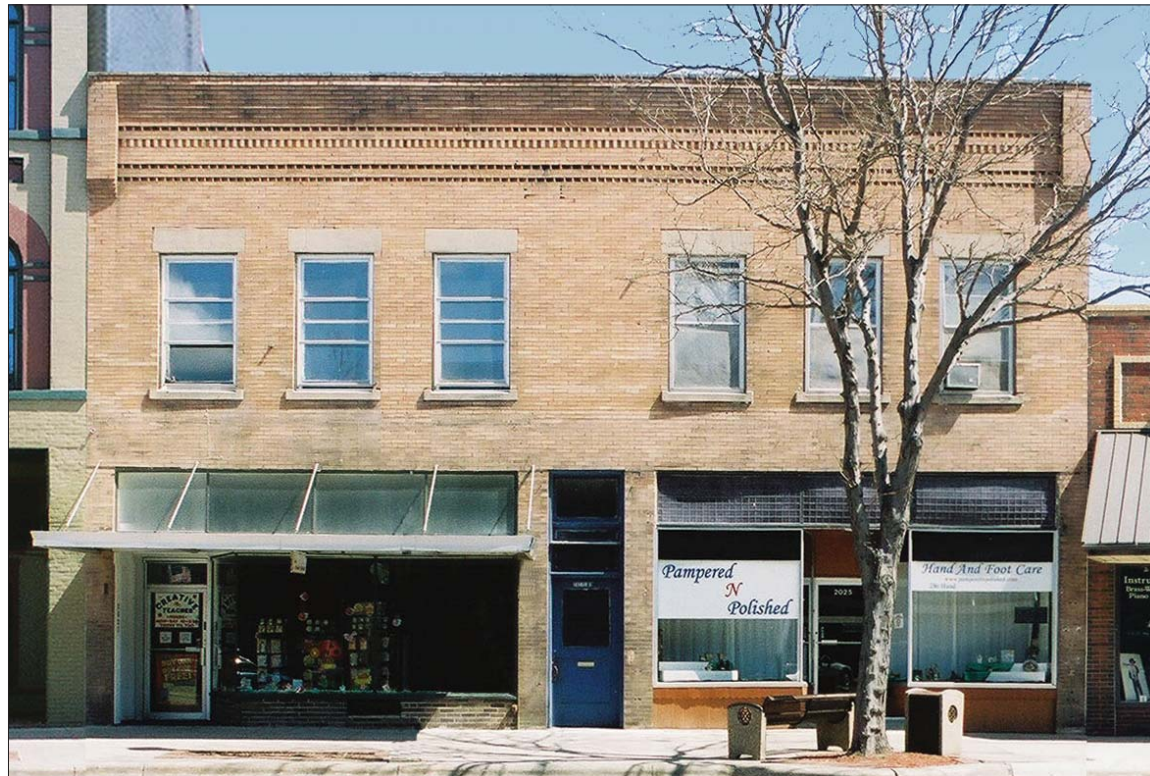
Image 2. Existing Condition: The Creative Teacher store is located in the north (left) half of the building pictured. The existing storefront has textured glass transom windows across its entire width and a metal canopy suspended above the storefront door and display window, but below the transom windows.