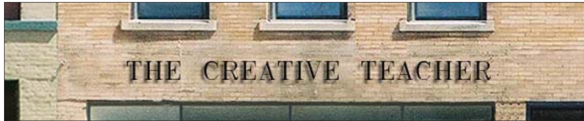
Image 10. Signage: The lettering, which could be either cut or cast metal, is mounted directly on the brick façade above the transom windows. The font for this signage, also depicted in Image 12, is RomanT.