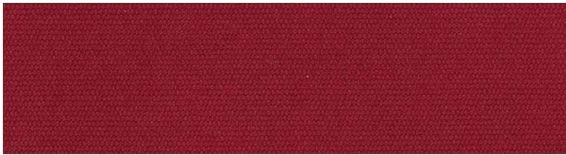
Image 9. Awning Fabric Sample: The fabric used for awnings depicted in Options 2.1 through 2.3 is Sunbrella's "Jockey Red" (#4603).