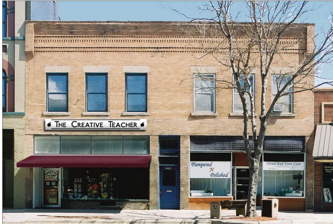
Image 17. Option 3.2: A new retractable awning (refer to Image 3) is installed above the storefront display window and below the transom windows. A new signboard (see Image 15) is mounted above the transoms. New bronze-colored metal double hung windows are installed on the second story.