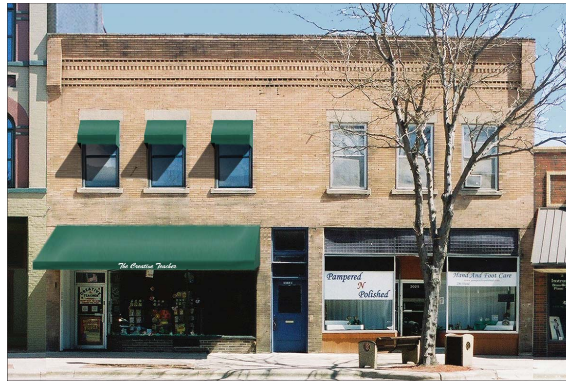
Image 6. Option 1.1: A full-width fixed awning is installed above the storefront door and display window, shielding the transom windows. Signage is appliquéed to the awning valance. Three fixed awnings are installed on the new bronze-colored metal double hung windows on the second story.