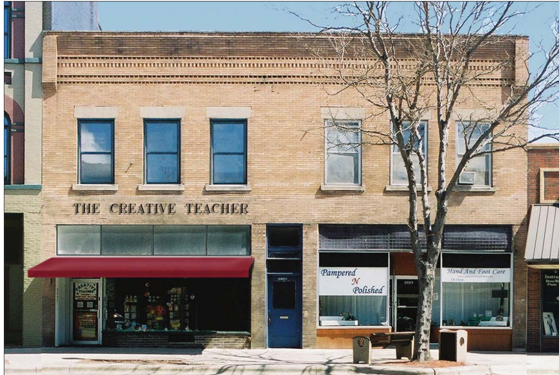
Image 12. Option 2.2: A new retractable awning (refer to Image 3) is installed above the storefront display window and below the transom windows. New signage (see Image 10) is mounted above the transom windows. New bronze-colored metal double hung windows are installed on the second story.