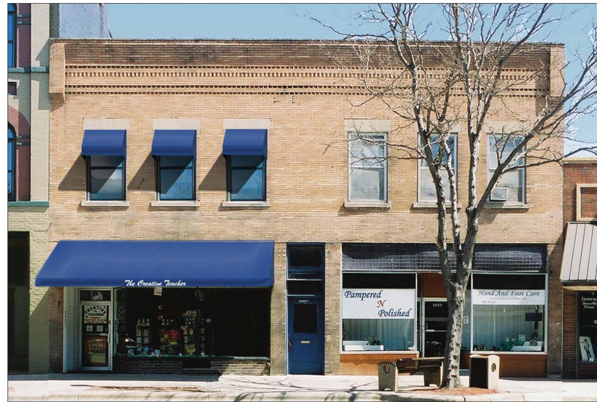
Image 21. Option 4.1: A full-width fixed awning is installed above the storefront door and display window, shielding the transom windows. Signage is appliquéd to the awning valance. Three fixed awnings are installed on the new bronze-colored metal double hung windows on the second story.