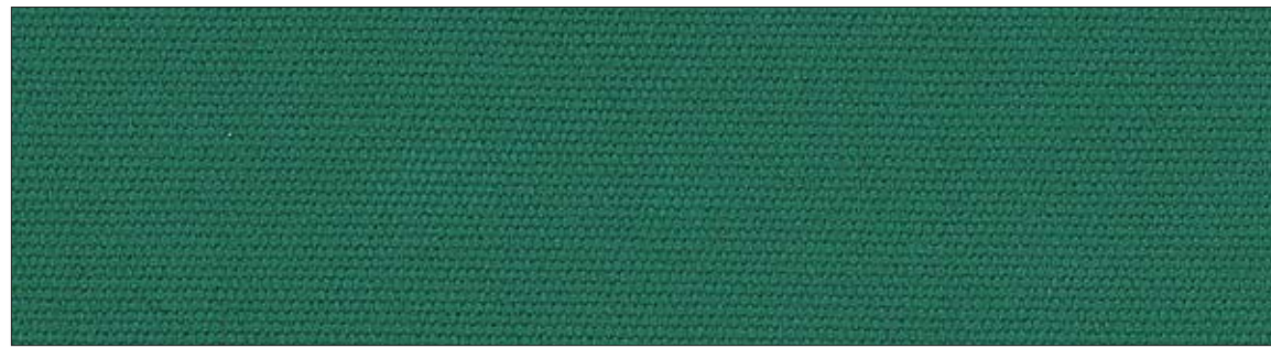
Image 4. Awning Fabric Sample: The fabric used for awnings depicted in Options 1.1 through 1.3 is Sunbrella's "Erin Green" (#4600).