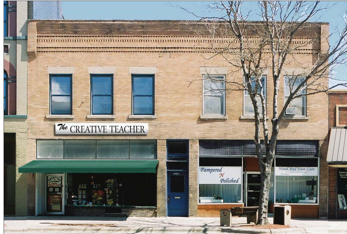
Image 7. Option 1.2: A new retractable awning (refer to Image 3) is installed above the storefront display window and below the transom windows. A new signboard (see Image 5) is mounted above the transom windows. New bronze-colored metal double hung windows are installed on the second story.