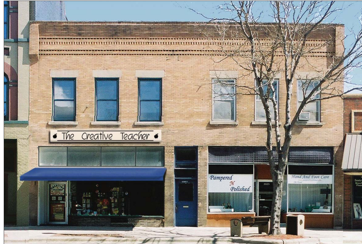
Image 22. Option 4.2: A new retractable awning (refer to Image 3) is installed above the storefront display window and below the transom windows. A new signboard (see Image 20) is mounted above the transoms. New bronze-colored metal double hung windows are installed on the second story.