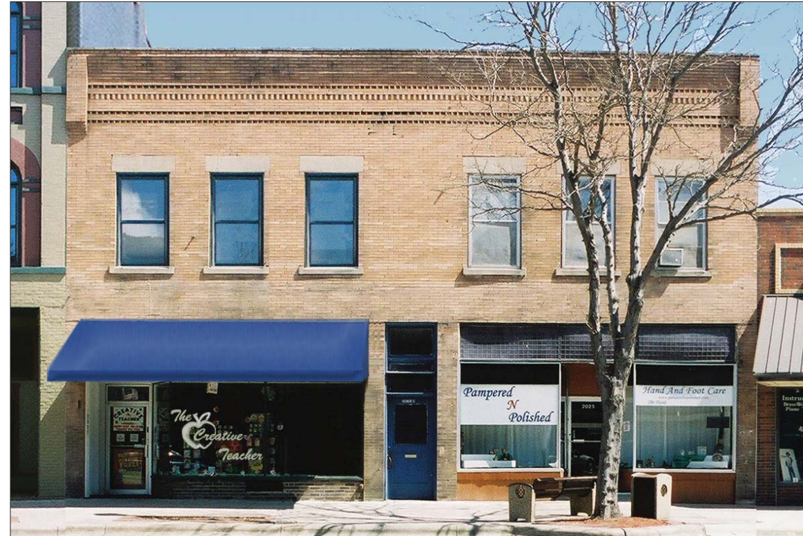
Image 23. Option 4.3: A full-width fixed awning is installed above the storefront door and display window, shielding the transom windows. Vinyl signage is appliquéd to the storefront window. New bronze-colored metal double hung windows are installed on the second story.