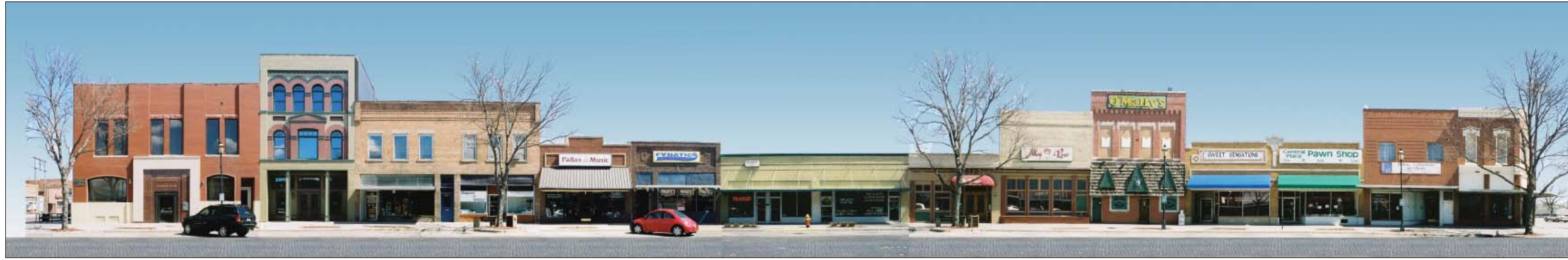
Image 1. Existing Streetscape: The Creative Teacher store is located on the north half of a two-story brick building situated on the east side of the 2000 block of Central Avenue. The block face consists of a continuous row of storefronts dating from the late 19th to early 20th Centuries, even though some of the original storefronts have been altered in misguided efforts to “modernize.” The building in which the Creative Teacher store is located is located toward the north (left) end of the block, adjacent to a three-story recently-remodeled building to the north and a one-story building to the south.