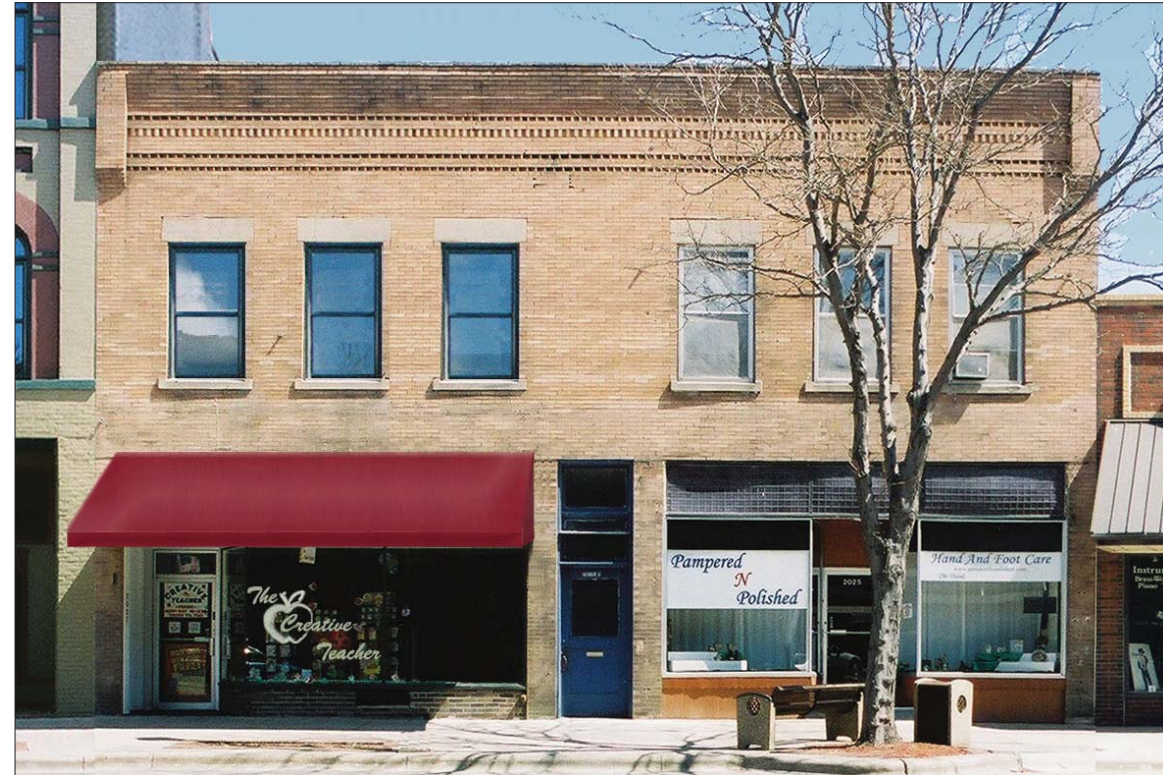
Image 13. Option 2.3: A full-width fixed awning is installed above the storefront door and display window, shielding the transom windows. Vinyl signage is appliquéd to the storefront window. New bronze-colored metal double hung windows are installed on the second story.