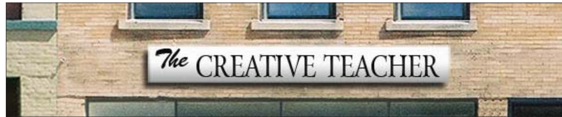
Image 5. Signboard: This signboard (shown also in Image 7) utilizes Artisan and Times New Roman fonts.