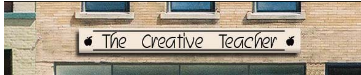
Image 20. Signboard: This signboard (shown also in Image 22) utilizes Scroll font and two symbolic apple icons for embellishment. The background color of the signboard is similar to the color of brick on the façade.