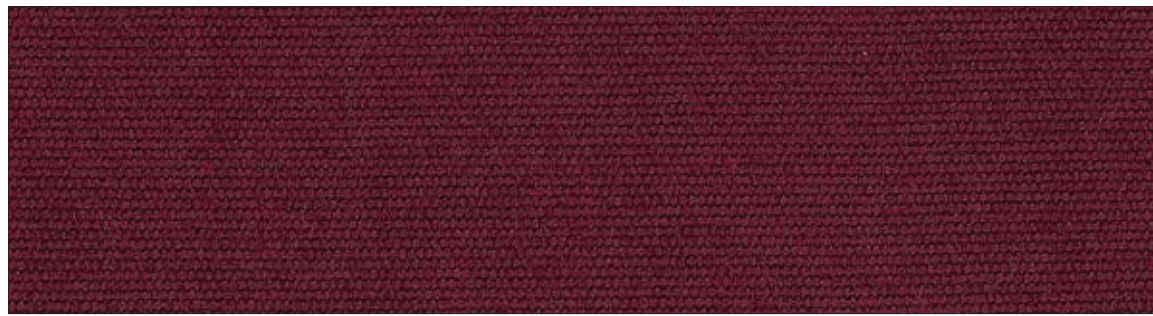
Image 14. Awning Fabric Sample: The fabric used for awnings depicted in Options 3.1 through 3.3 is Sunbrella's "Burgundy" (#4631).