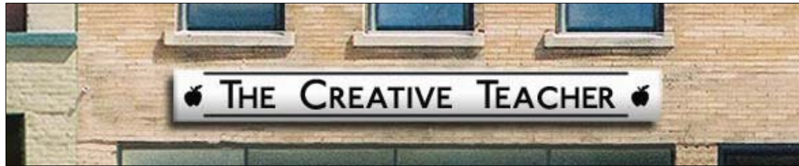
Image 15. Signboard: This signboard (shown also in Image 17) utilizes PaddingtonSC font and two symbolic apple icons for embellishment.