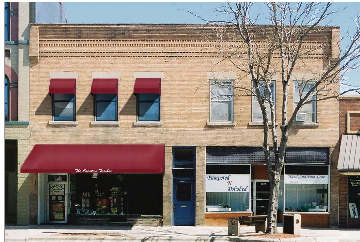
Image 11. Option 2.1: A full-width fixed awning is installed above the storefront door and display window, shielding the transom windows. Signage is appliquéd to the awning valance. Three fixed awnings are installed on the new bronze-colored metal double hung windows on the second story.