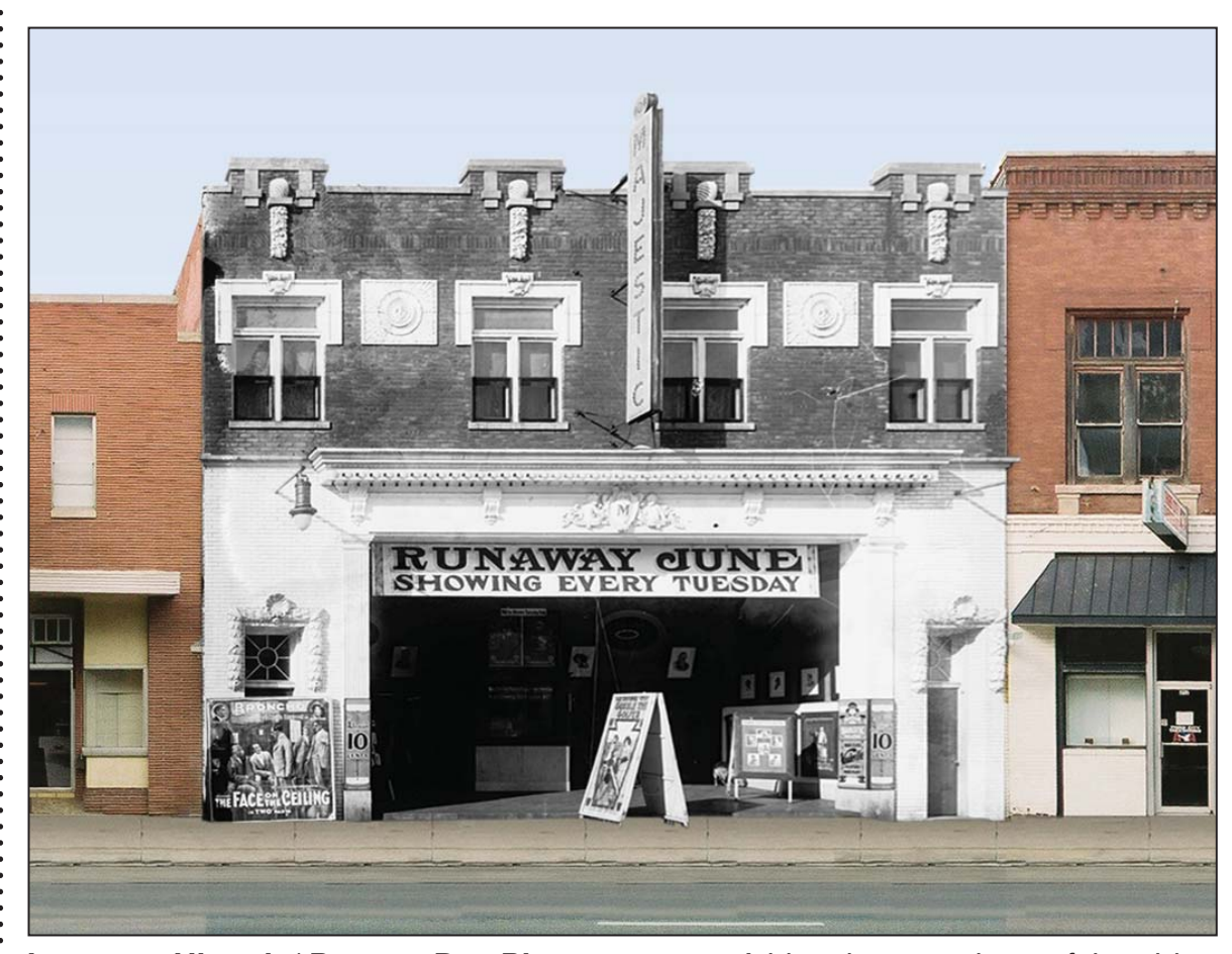
Image 1. Historic/ Present Day Photomontage. A historic 1915 photo of the old Majestic Theatre is superimposed on a photograph of the current block façade. The early photograph of the Majestic Theatre building, including second story window hoods, coping, cornice, medallions, etc., shows extensive terra-cotta ornamenta-