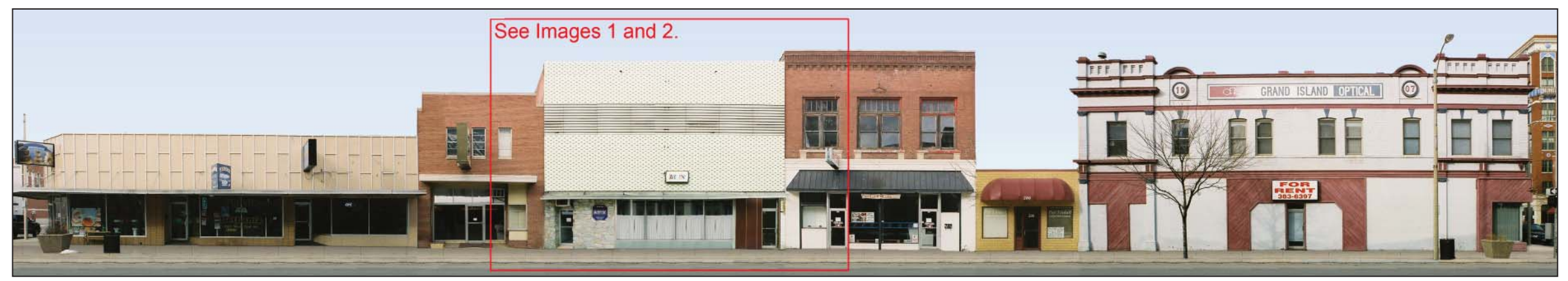
Image 3. Existing Condition. The Majestic Theatre building is located on the north side of the 200 block of West 2nd Street between Bailey Photography and Third City Taekwondo.