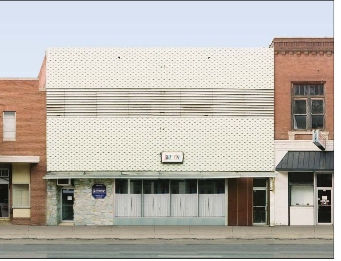
Image 2. Existing Condition. In recent years a metal false front was installed over the upper portion of the Majestic Theatre building façade. The lower façade was reconfigured to address recent building needs. Because the false front remains intact, the condition of the original façade is unknown, although it appears that the decorative vertical extensions of the parapet wall have been removed.