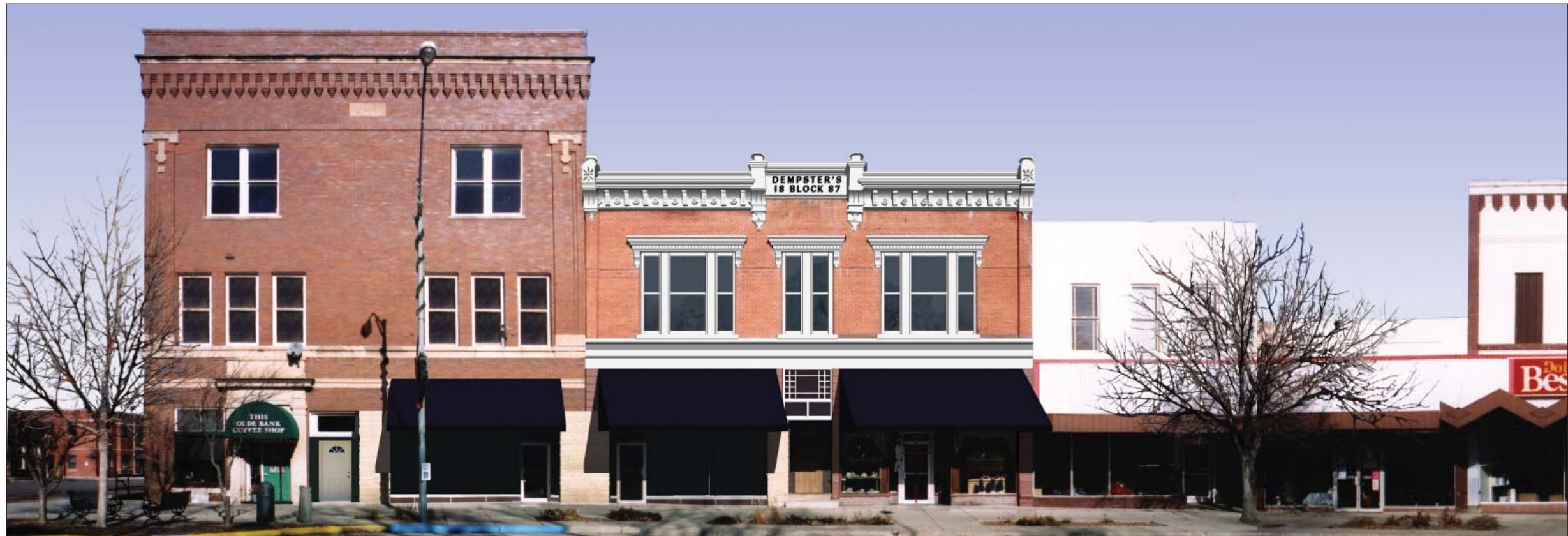
Image 6. Option 2 (South Facade): The existing awning/canopy is removed from both the F&M Building and Dempster's Block and is replaced with three awnings (fabric is Sunbrella's "Navy" #4626). The removal of the awning/canopy will presumably reveal transom windows on both buildings, as well as cast iron piers on the Dempster's Block, extending to the second floor level. New second floor windows on the Dempster's Block are installed, and the architectural features including the window frames, hoods and cornice are painted white. All of the existing signage at the second floor level is removed.