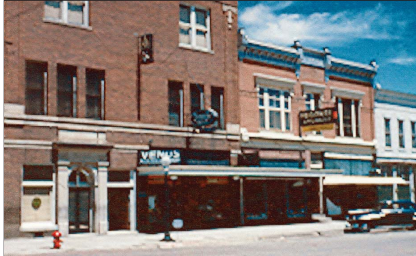
Image 2. Historic Photograph (South Facade Perspective): This 1950 photograph shows the south facade of the F & M Building, which replaced the Citizen's Bank building, as well as the adjacent Dempster's Block. Canopies have replaced the awnings seen in Image 1 and perpendicular signage has been added to both buildings at the second-story level.