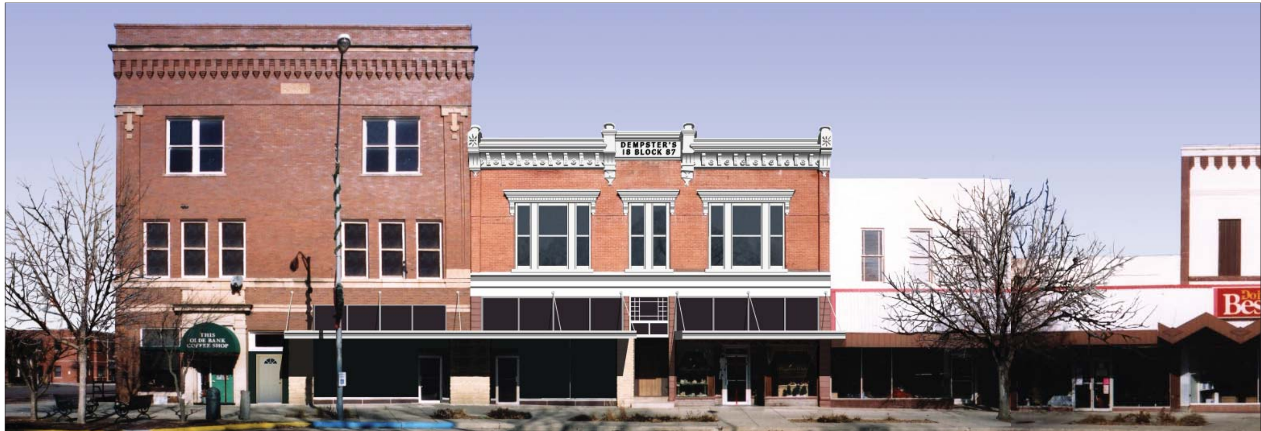
Image 5. Option 1 (South Facade): The existing awning/canopy is removed from both the F&M Building and Dempster's Block and is replaced with two new, flat metal canopies, reminiscent of the canopies seen in the 1950 photograph. The removal of the awning/canopy will presumably reveal transom windows on both buildings, as well as cast iron piers on the Dempster's Block, extending to the second floor level. New second floor windows on the Dempster's Block are installed, and the architectural features including the window frames, hoods and cornice are painted white. All of the existing signage at the second floor level is removed.