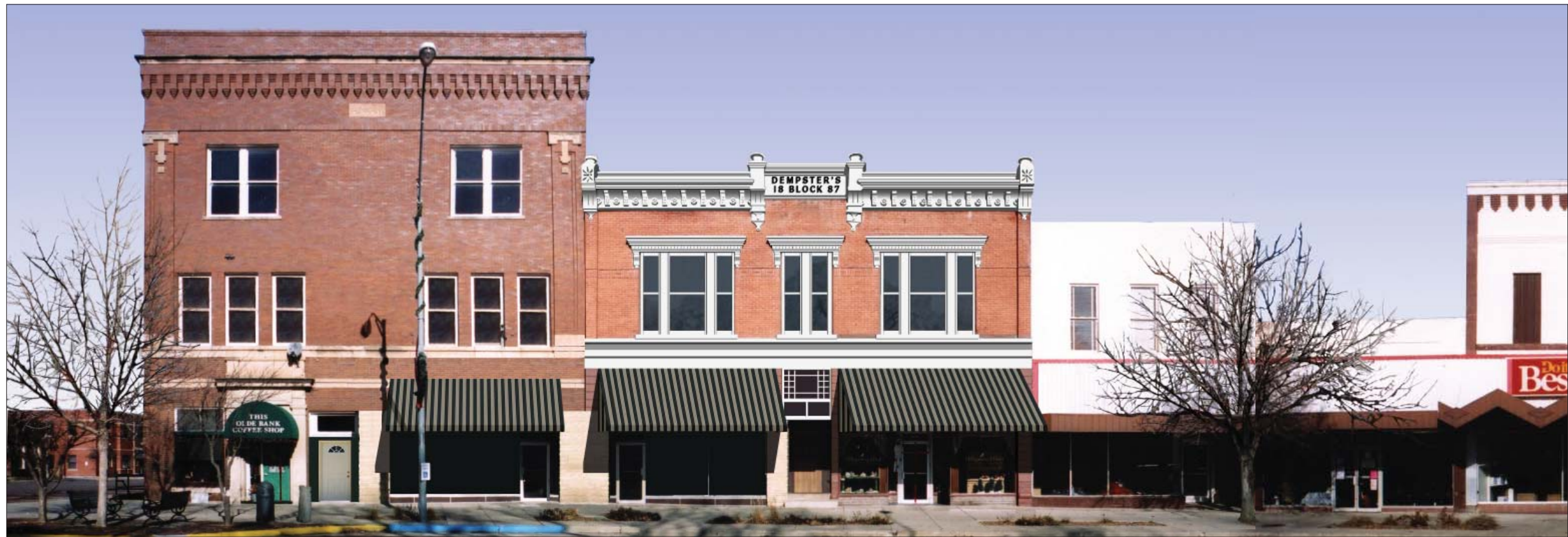
Image 8. Option 4 (South Facade): The existing awning/canopy is removed from both the F&M Building and Dempster's Block and is replaced with three awnings (fabric is Sunbrella's "Alpine Beige" #4928). The removal of the awning/canopy will presumably reveal transom windows on both buildings, as well as cast iron piers on the Dempster's Block, extending to the second floor level. New second floor windows on the Dempster's Block are installed, and the architectural features including the window frames, hoods and cornice are painted white. All of the existing signage at the second floor level is removed.