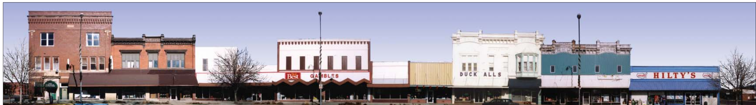
Image 4. Existing Condition (South Elevation Streetscape): The F & M Building and adjacent Dempster's Block are shown in the context of the entire existing blockface.