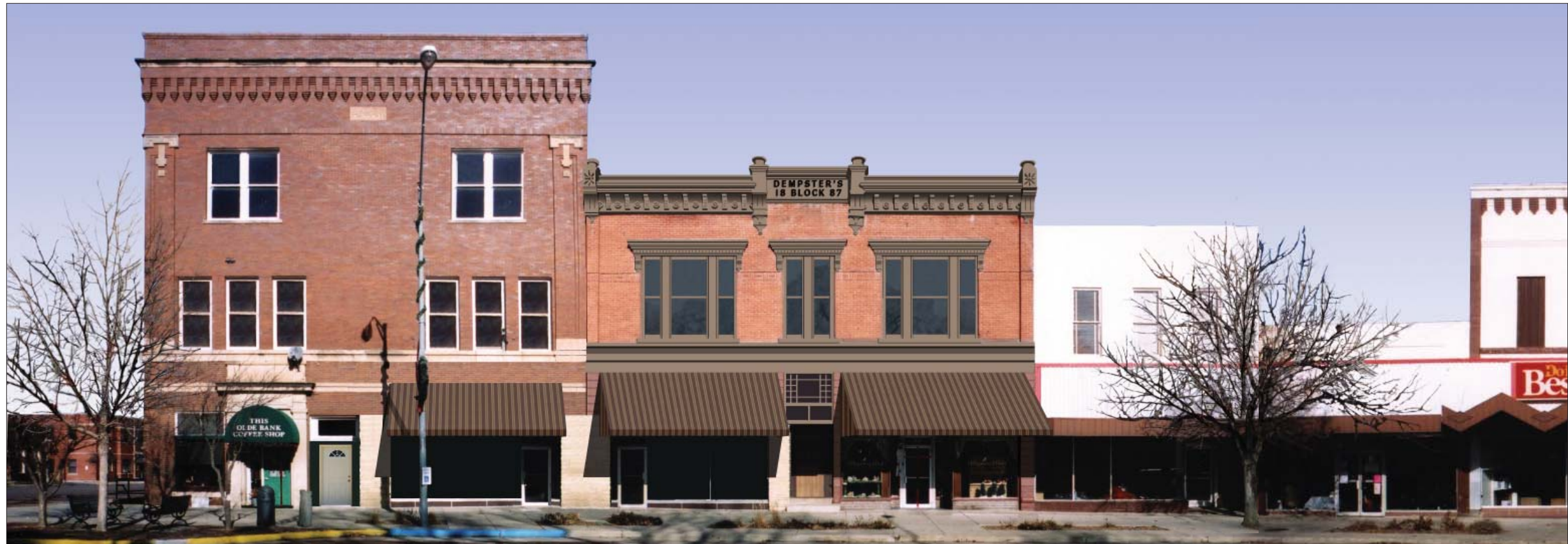
Image 10. Option 6 (South Facade): The existing awning/canopy is removed from both the F&M Building and Dempster's Block and is replaced with three awnings (fabric is Sunbrella's "Eastridge Cocoa" #4994). The removal of the awning/canopy will presumably reveal transom windows on both buildings, as well as cast iron piers on the Dempster's Block, extending to the second floor level. New second floor windows on the Dempster's Block are installed, and the architectural features including the window frames, hoods and cornice are painted light brown. All of the existing signage at the second floor level is removed.