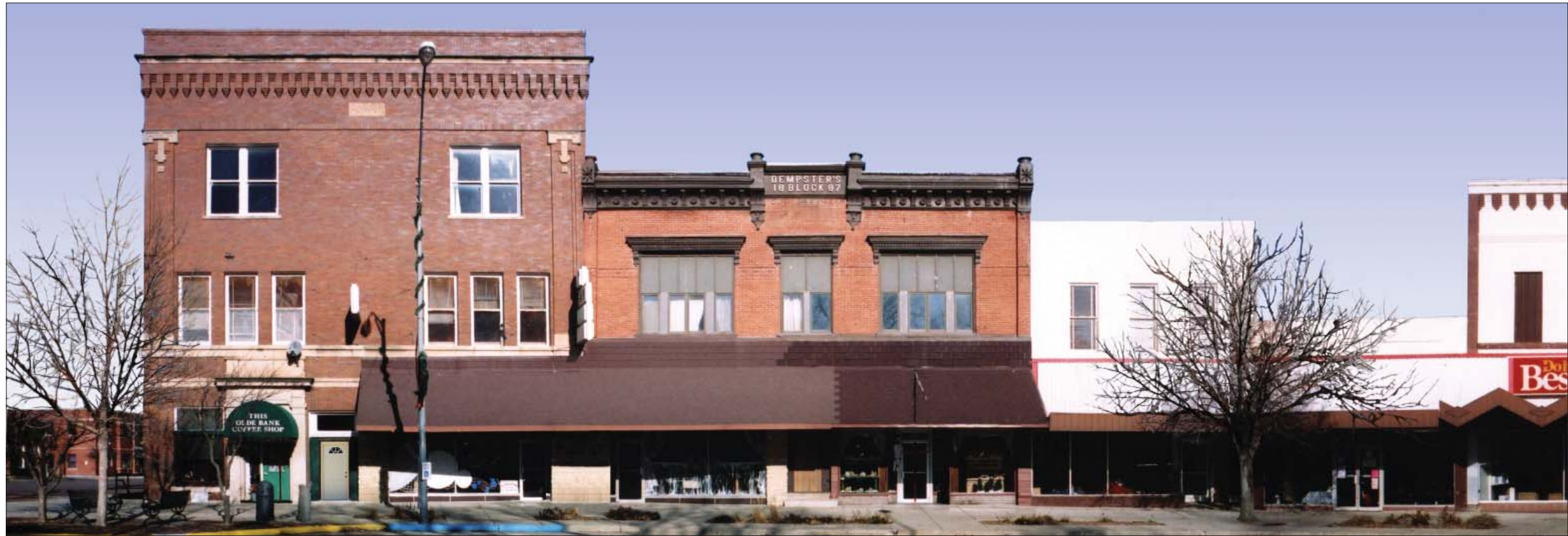
Image 3. Existing Condition (South Facade): The existing first floor of the F & M Building is divided into two separate spaces as viewed from the south facade. The western space is occupied by This Olde Bank Coffee Shop and the eastern half is connected to the western half of the adjacent Dempster's Block, which is currently unoccupied. The interior connection of these two buildings is expressed on the exterior by an enclosed awning/canopy which spans the length of the Dempster's Block and the eastern half of the F & M Building, covering up transom windows and many other architectural details. Back-lit, plastic-faced signage is mounted perpendicular to the building facades above the awning/canopy. Original second-story windows in the Dempster's Block have been removed and replaced with smaller windows with infill above, significantly compromising the architectural character of the upper facade.