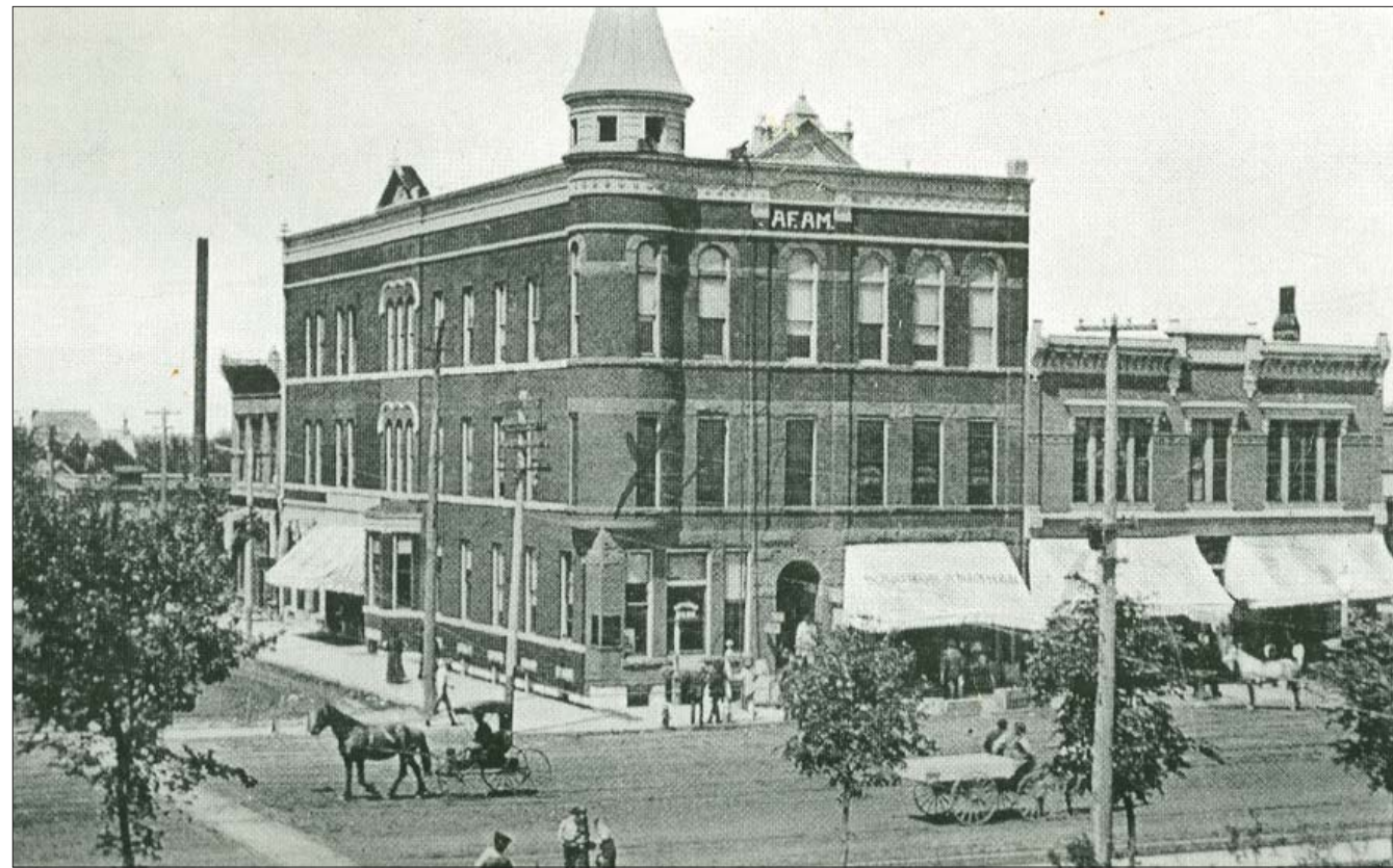
Image 1. Historic Photograph (Southwest Corner): Pictured in this undated photograph of the northeast corner of 9th and G Streets is the AF. AM./Citizen's Bank building which was destroyed by fire in 1910. Today, this is the location of the F & M Building shown in Image 2. To the east of the Citizen's Bank building is the Dempster's Block, showing the original configuration of the second-story windows, as well as two large awnings on the first floor.