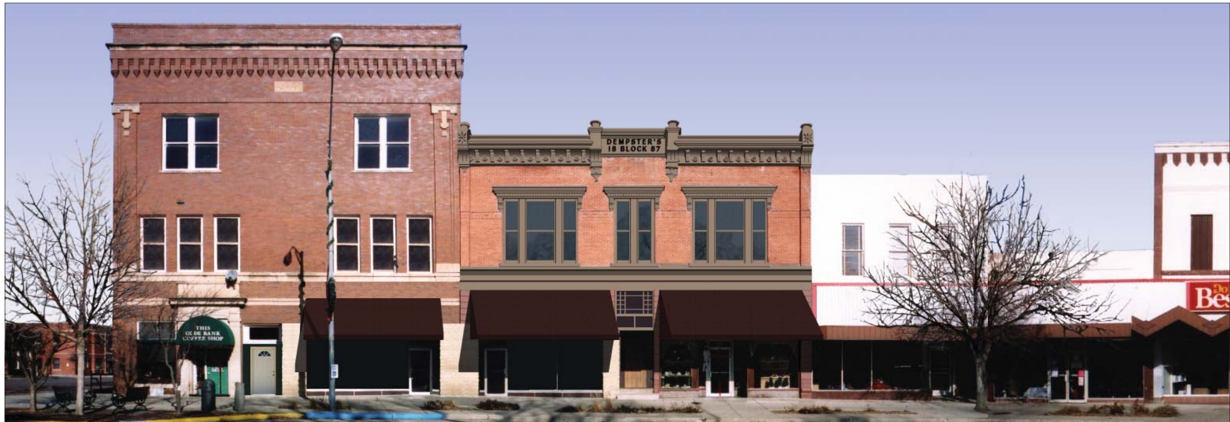
Image 9. Option 5 (South Facade): The existing awning/canopy is removed from both the F&M Building and Dempster's Block and is replaced with three awnings (fabric is Sunbrella's "True Brown" #4621). The removal of the awning/canopy will presumably reveal transom windows on both buildings, as well as cast iron piers on the Dempster's Block, extending to the second floor level. New second floor windows on the Dempster's Block are installed, and the architectural features including the window frames, hoods and cornice are painted light brown. All of the existing signage at the second floor level is removed.