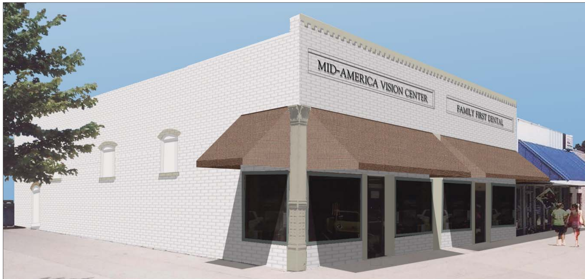
Image 8. Option 2 (Southwest Corner): All of the brick, including the existing unpainted brick below the south storefront windows, is repainted white, the existing color. The bulkhead built out from the original building façade above the south storefront windows is removed, and new recessed infill panels above new storefront windows are installed between the original now-fully-exposed cast iron columns. The awning fabric is Sunbrella's "Mocha" (#4616). The primary façade color is "Angel Wings" (#1016); the secondary color (ie. cast iron columns) is "Flagstaff" (#2264).