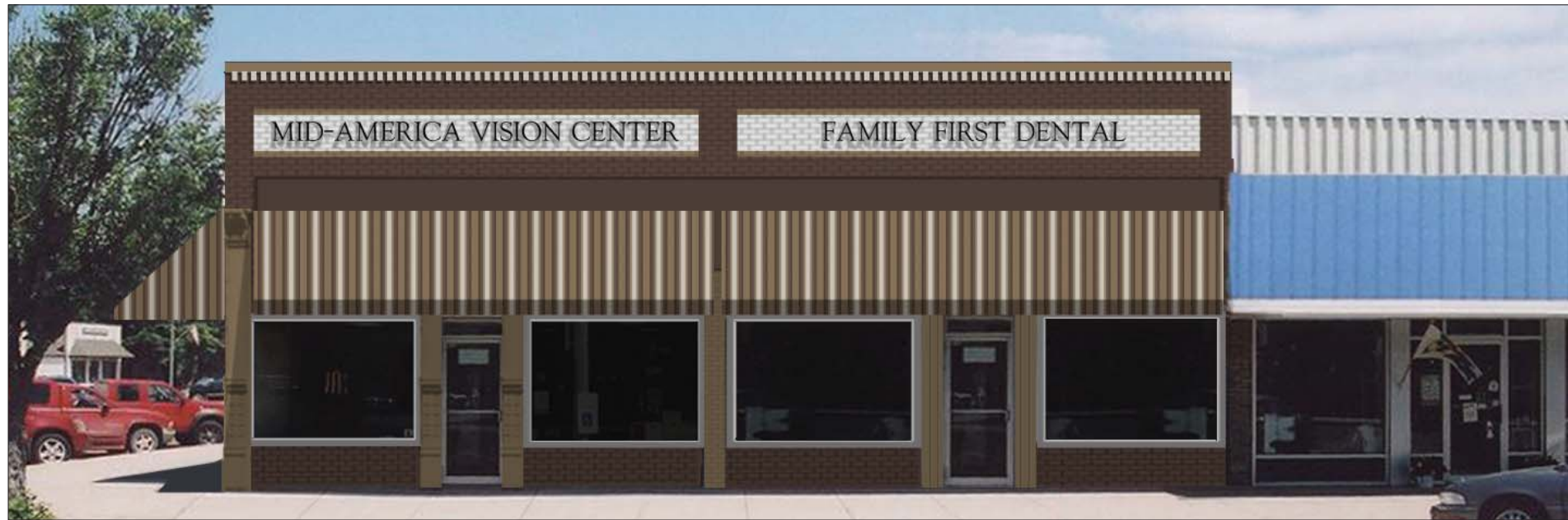
Image 12. Option 3 (South Facade): The signage consists of individual black plastic letters affixed in the recesses directly to the face brick. The font is Goudy Old Style.