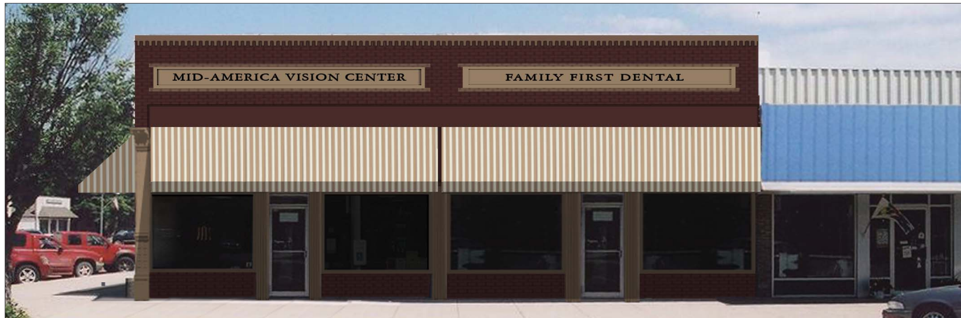
Image 15. Option 4 (South Facade): New signboards are installed in the elongated rectangular recesses located in the upper south façade. The font is Roman Classic.