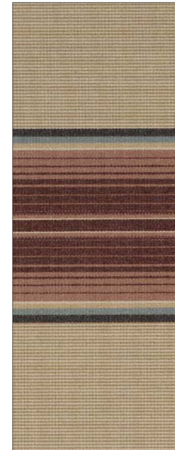
Image 7. Awning fabric "Brass/Beige Pinstripe" #4952 by Sunbrella.