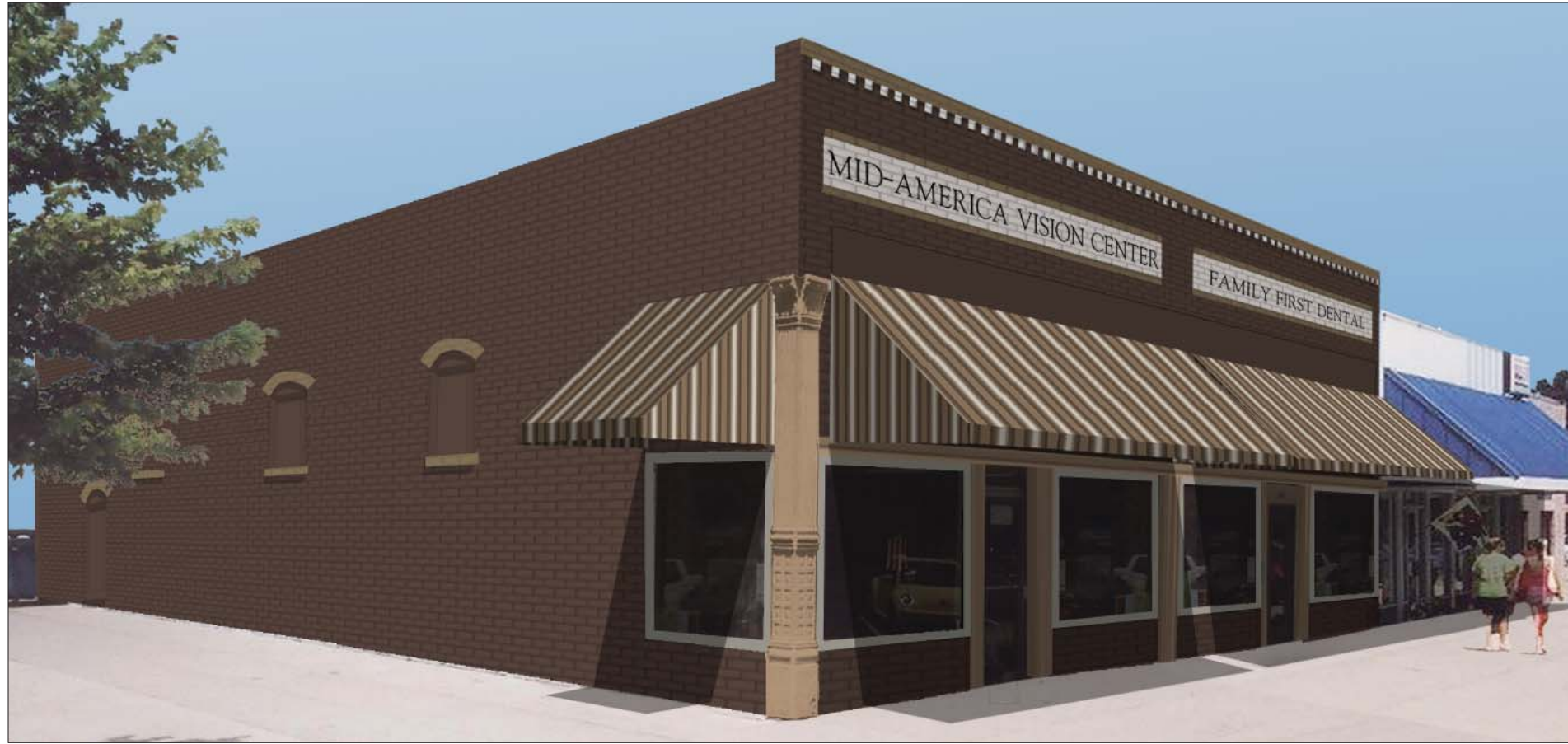
Image 11. Option 3 (Southwest Corner): All of the brick, including the existing unpainted brick below the south storefront windows, is given a new paint color. New storefront windows are installed. The south awnings are mounted on the surface of the existing bulkhead above the storefront windows. The fabric is Sunbrella's "Beige/White" (#4796). The primary façade color is "Spectrum Brown" (#2006); the secondary color (ie. cast iron columns) is "Mauve Beige" (#2005); the tertiary color (ie. brick dentils) is "Brevity" (#2295).