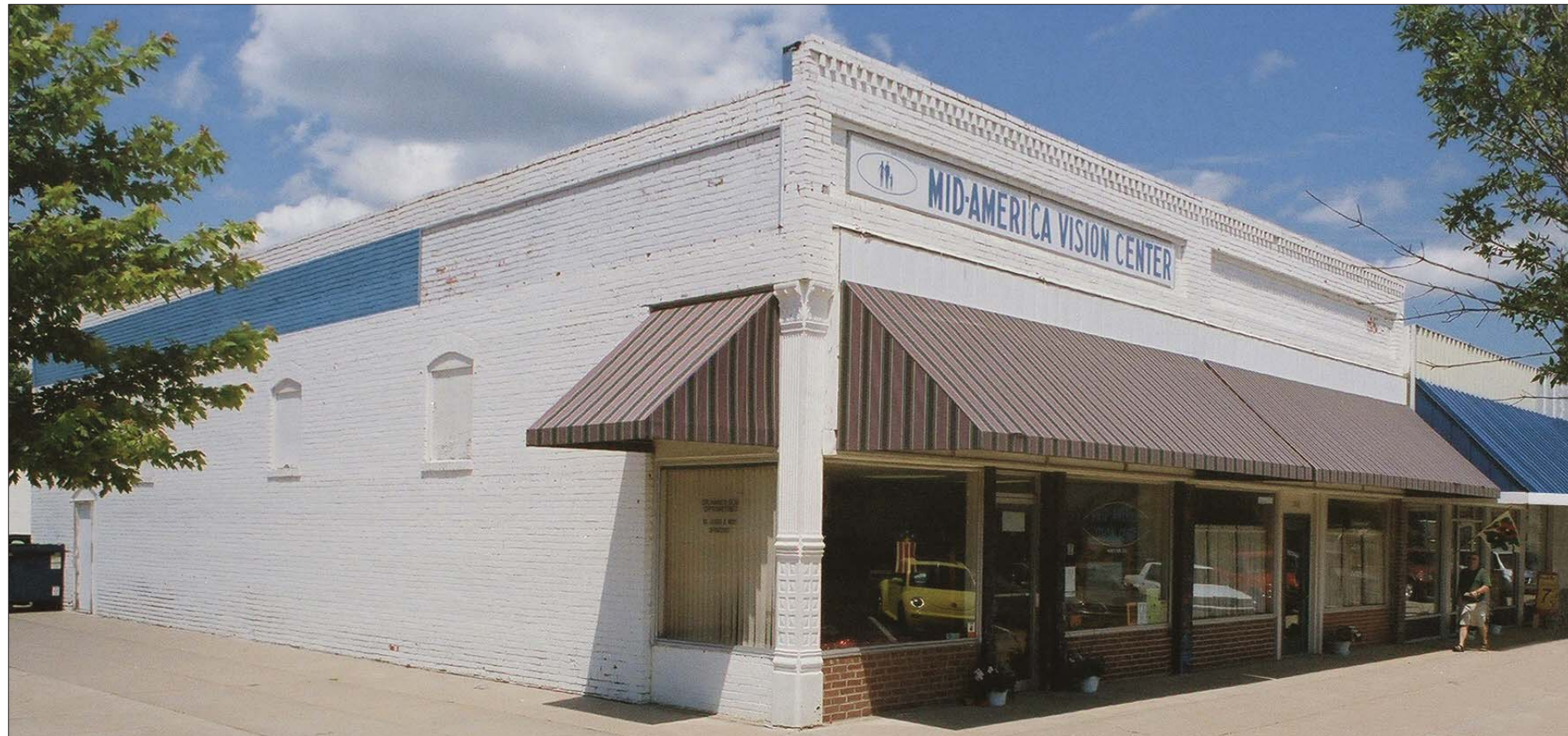
Image 1. Existing Condition (Southwest Corner): With the exception of the brick bulkheads below the storefront windows on the south façade of the building, all of the exterior brick and other architectural details are painted. White is the predominant color. The paint is peeling in many locations. A wide band along the upper portion of west side of the building is painted blue, apparently an extension of a preexisting sign that was mounted near the southwest corner. Metal framing from the sign remains attached to the building, but it is removed in all of the design options presented. Window openings on the west wall are infilled with opaque panels.