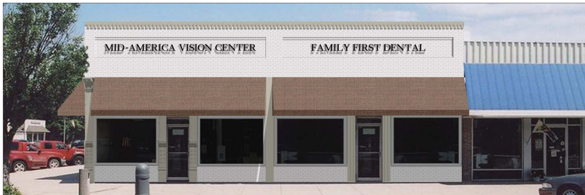
Image 9. Option 2 (South Facade): The signage on the storefront is black, formed plastic, Caslon Bld Rnd Face font. The removal of the bulkhead above the south storefront windows shows the continuation of the center pier to the top of the awning.