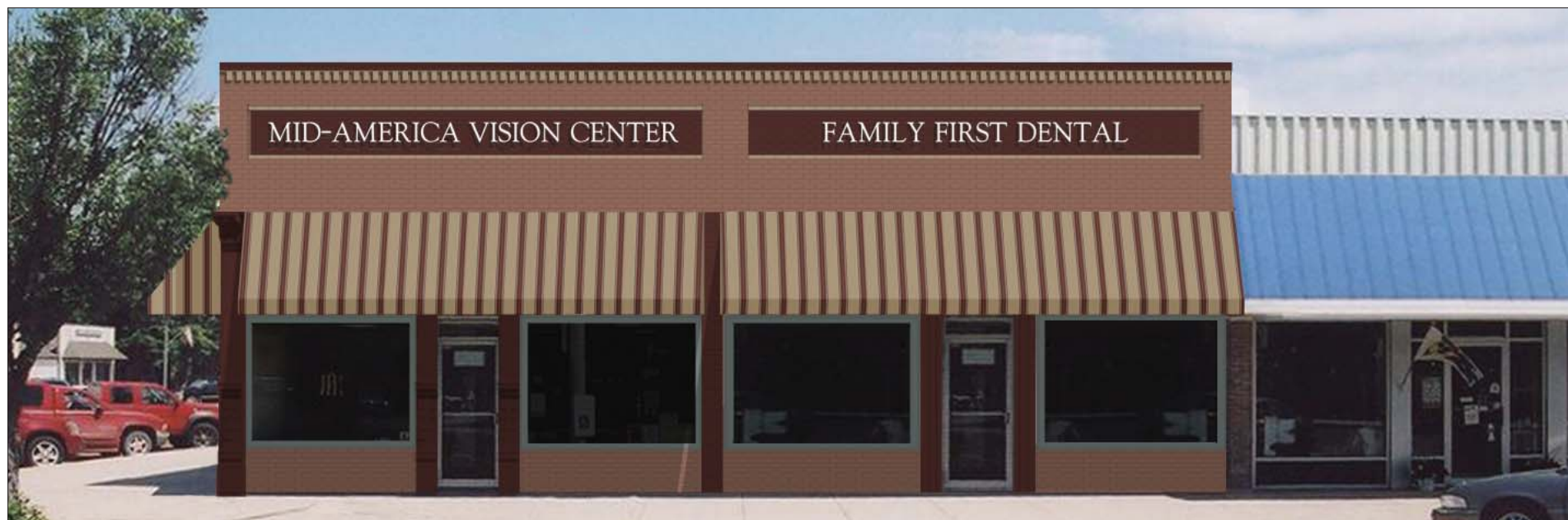
Image 6. Option 1 (South Facade): New signboards are installed in the elongated rectangular recesses located in the upper south façade. Alternatively, the signage—consisting of individual, white, formed plastic letters—can be affixed in the recesses directly to the face brick. The font is Goudy Old Style. Removal of the bulkhead above the south storefront windows presumably will allow full exposure of all the cast iron columns, the middle one shown in this image between the two awnings.