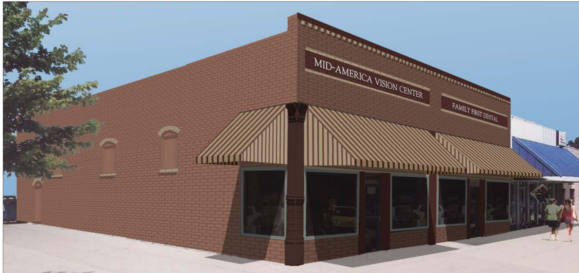
Image 5. Option 1 (Southwest Corner): All of the brick, including the existing unpainted brick below the south storefront windows, is given a new paint color. The bulkhead built out from the original building façade above the south storefront windows is removed, and new recessed infill panels above new storefront windows are installed between the original now-fully-exposed cast iron columns. The awning fabric is Sunbrella's "Brass/Beige Pinstripe" (#4952). The primary façade color is "Petaluma" (#2272); the secondary color (ie. cast iron columns) is "Clove Dust" (#2267); the tertiary color (ie. brick dentils) is "Lamswool" (#2269).