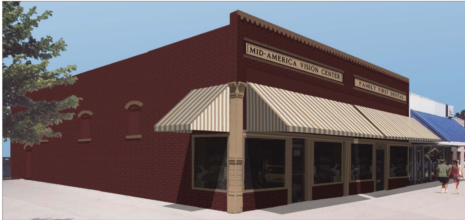
Image 14. Option 4 (Southwest Corner): All of the brick, including the existing unpainted brick below the south storefront windows, is given a new paint color. New storefront windows are installed. The south awnings are mounted on the surface of the existing bulkhead above the storefront windows. The fabric is Sunbrella's "Heather Beige" (#4956). The primary façade color is "Brandywine" (#2014); the secondary color (ie. cast iron columns) is "Mauve Beige," (#2004); the tertiary color (ie. brick dentils) is "Adobe," #2005.