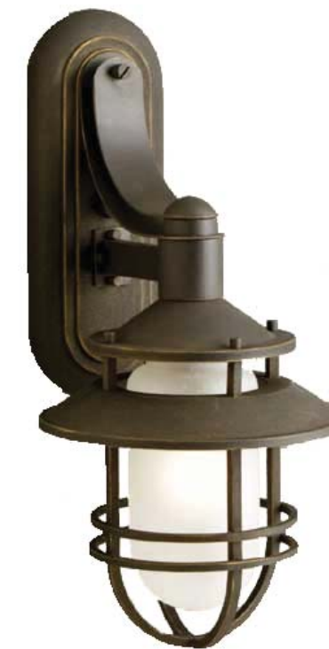
Image 17: Craftsman Mission Lamps, Newport Exterior Wall Mount (Model K9733OZ), bronze finish. 19" H x 9" W x 11" D