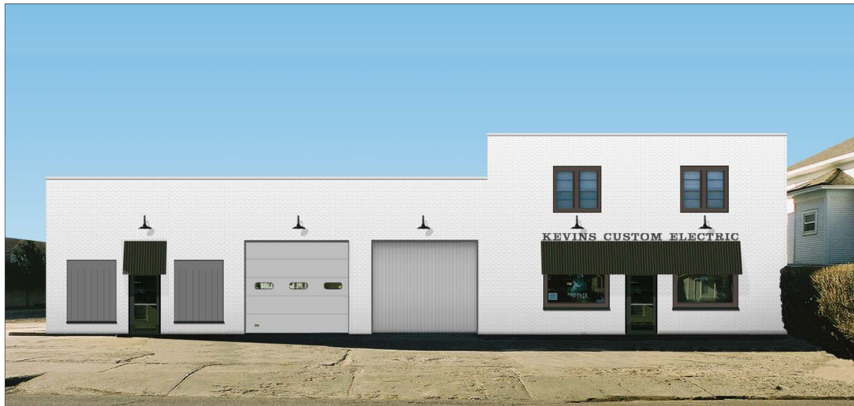
Image 5. Option 1 (North Facade): The signage on the storefront is dark gray, formed plastic, Consort font.