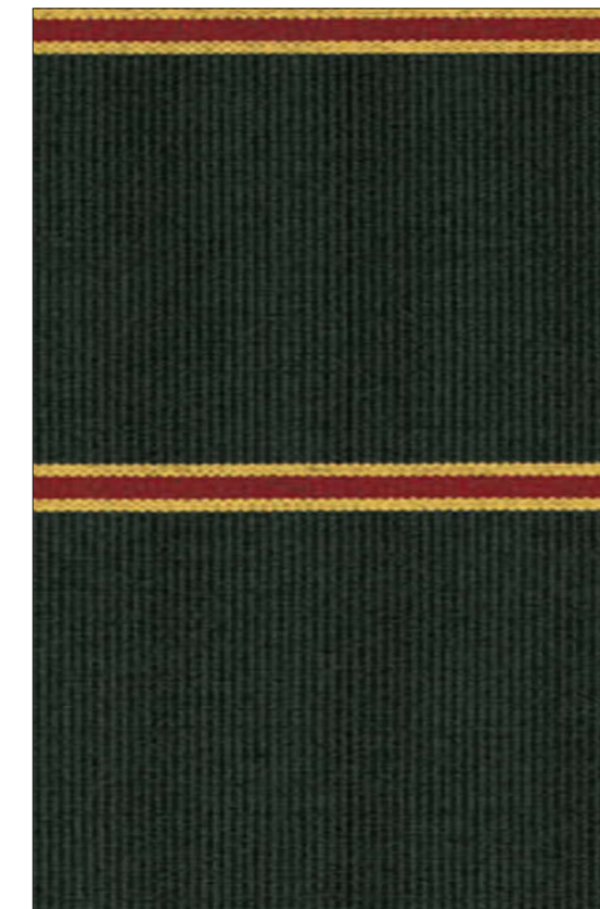
Image 6: Sunbrella fabric sample "Forest Green Regimental" (#4963).