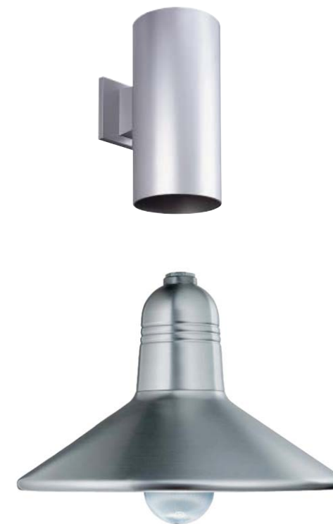
Image 8: (Top) Progress (#P5641) downlight, metallic gray. 6" diameter. (Bottom) Abolite Harbor (#HBR 20"), painted natural aluminum finish. 20" diameter, gooseneck #GB B 3 GWT.