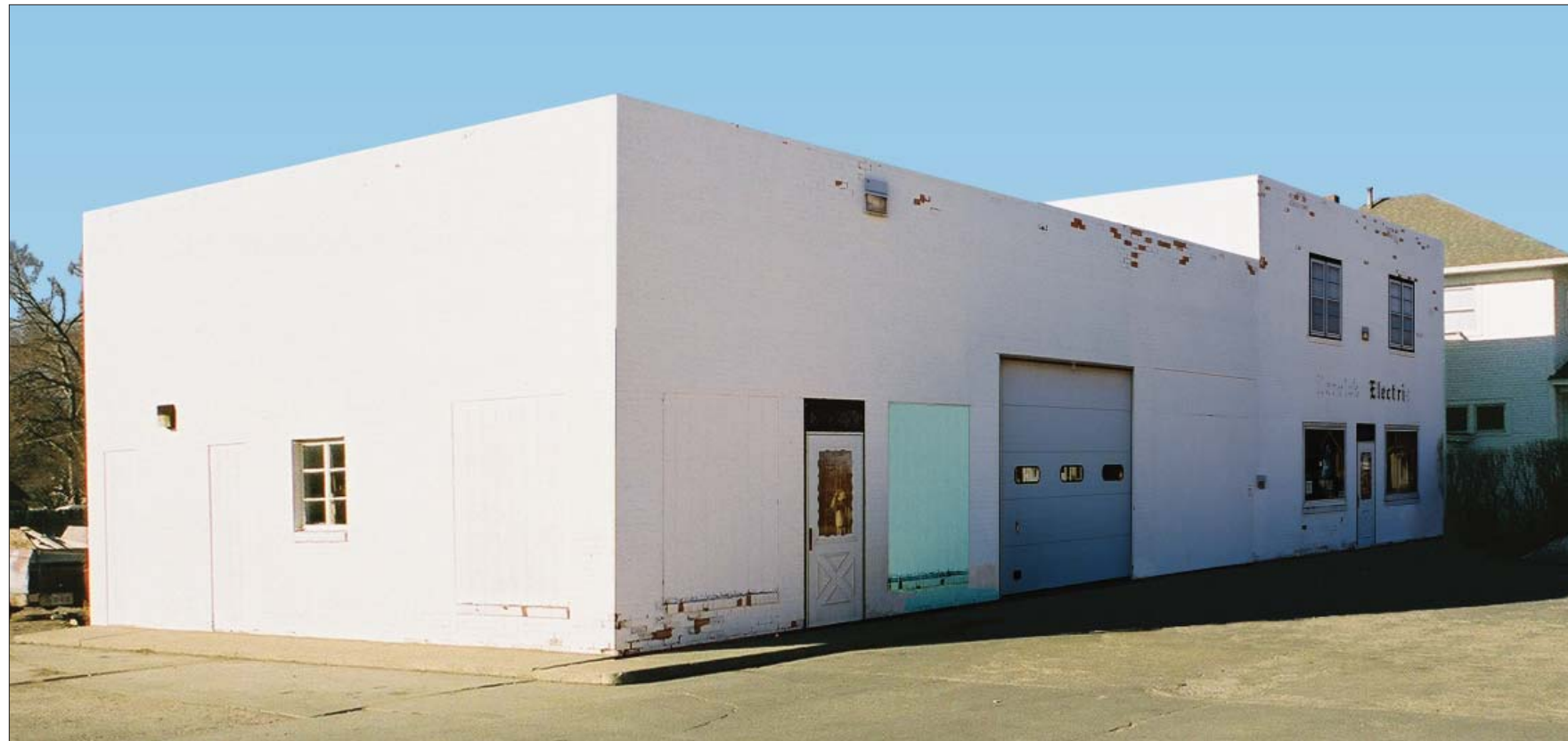
Image 1. Existing Condition (Northeast Corner): A garage door and two windows have been replaced with infill on the north facade and two doors and a window have similarly been infilled on the east facade.