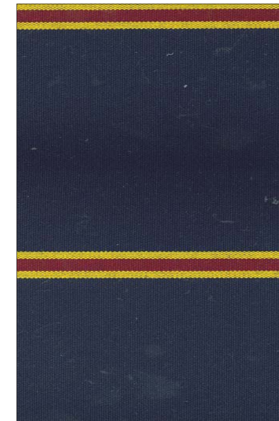
Image 14: Sunbrella fabric sample "Captain Navy Regimental" (#4962).