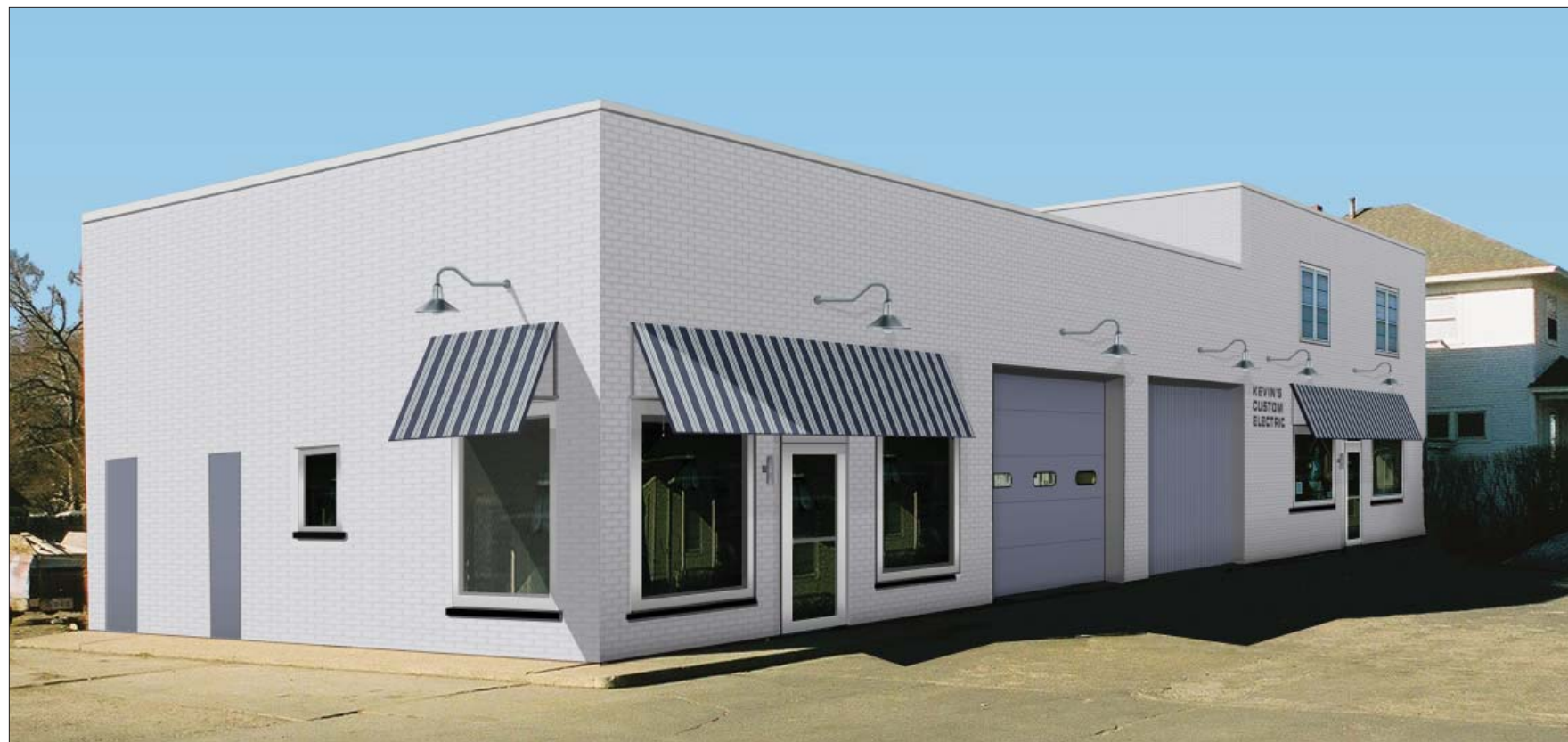
Image 7. Option 2 (Northeast Corner): New aluminum windows and doors are installed. The garage door and remaining infills are painted similar to "Duckling" paint color (#1267). The brick is painted similar to "Starlight" paint color (#1251). Aluminum flashing has been added along the top of the parapet wall. The lamps are illustrated in Image 8, and the awning fabric is shown in Image 10.