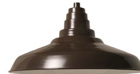
Image 12: Vented Shade by American Nail Plate (#VW512), gloss bronze finish. 16" diameter, gooseneck.