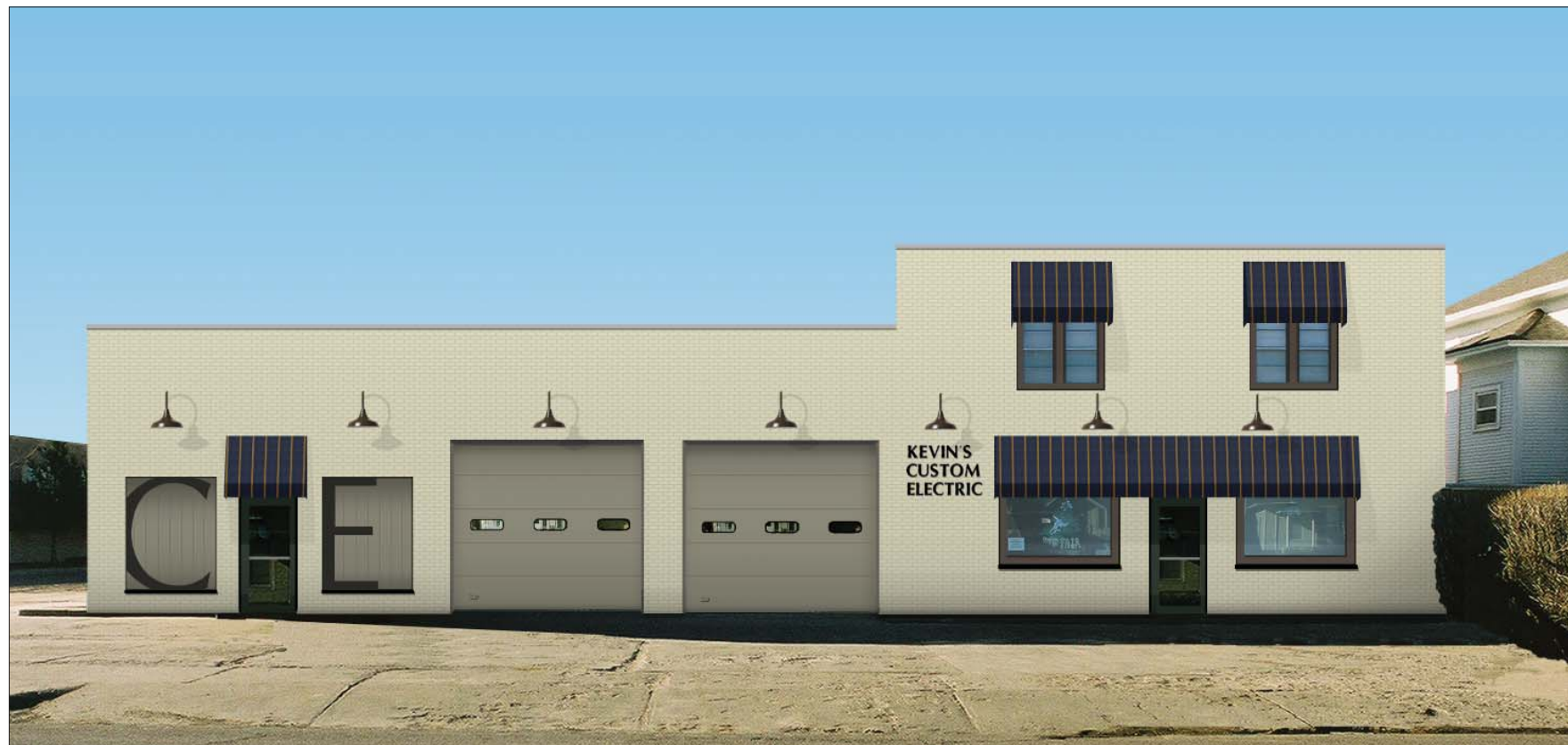
Image 13. Option 3 (North Facade): The signage on the storefront is dark gray, formed plastic, Optima SemiBold Extended Italic font.