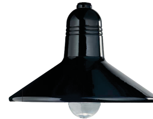
Image 16: Abolite Harbor (#HBR 20"), gloss black finish. 20" diameter, gooseneck #GB B 3 GWT.