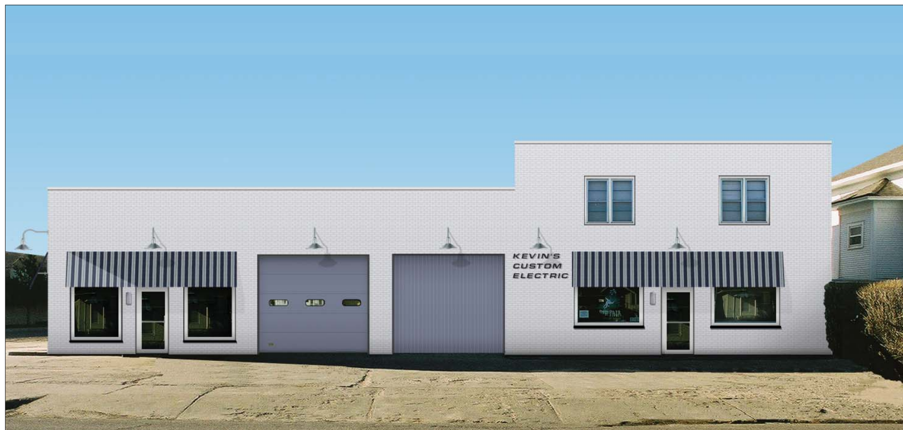
Image 9. Option 2 (North Facade): The signage on the storefront is dark gray, formed plastic, Eurostyle Bold Extended Italic font.