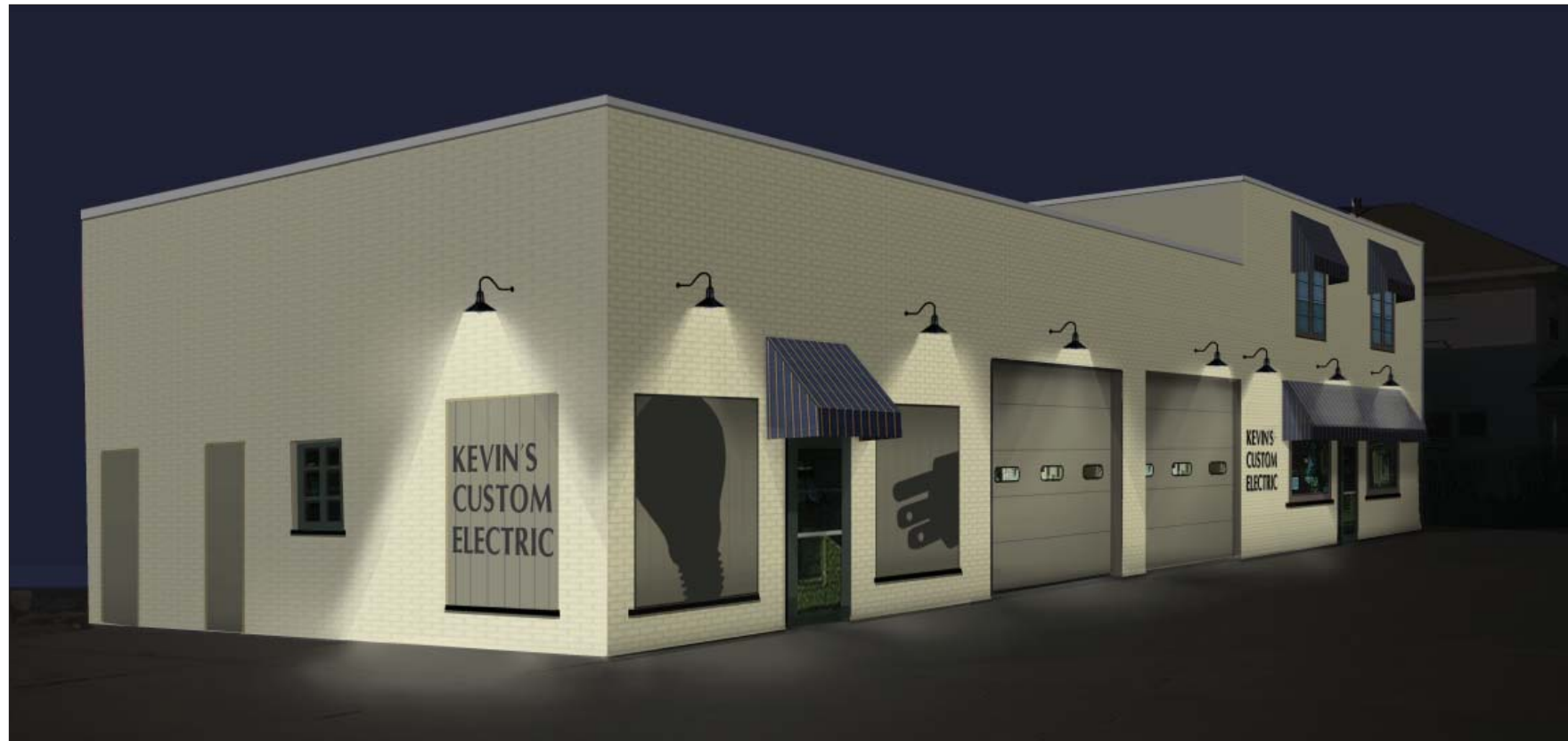
Image 15. Option 4 (Northeast Corner, Night Rendering): This option varies in two ways from Option 3. The position of the lighting fixtures remains the same, but the fixtures themselves are black and of a different style (see Image 16). The night view demonstrates the lighting used in this option. The letters for the signage on the north wall are made of cast metal to resist damage. The infilled windows on the northeast corner of the building include painted lettering and imagery. The gooseneck lamp is illustrated in Image 16.