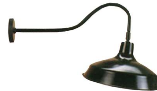
Image 4: Gooseneck sign light with angled reflector #23850 by Primelite, powder coated black finish. 16" diameter.