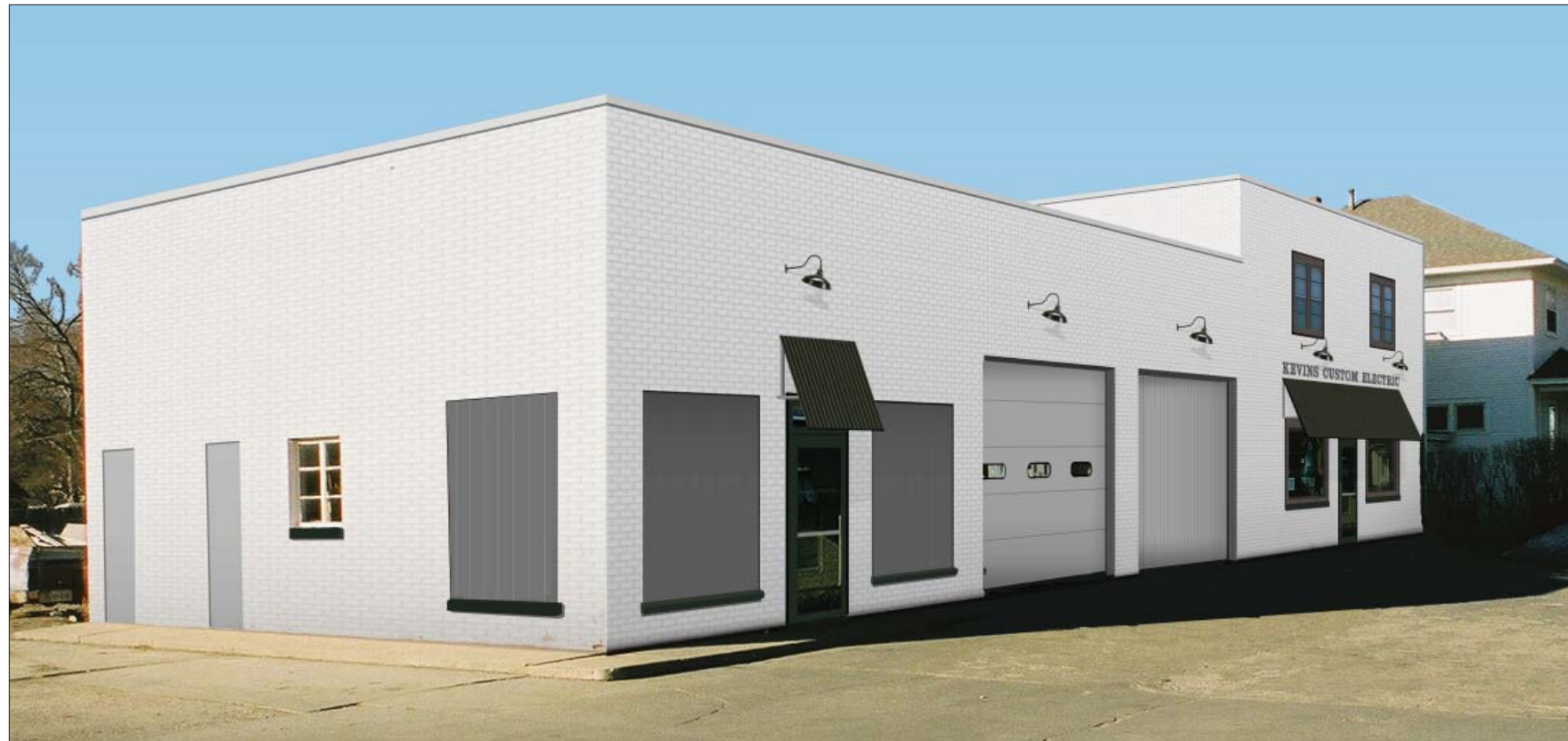
Image 3. Option 1 (Northeast Corner): New bronze window frames and doors are installed. The garage doors and east facade door infills are painted similar to the color "Gentry Gray" (#2317) and window infill is painted similar to the color "Lava" (#2318). The brick is painted similar to the color "Angel Wings" (#1016). Aluminum flashing has been added along the top of the parapet wall. The gooseneck lamp is illustrated in Image 4, and the awning fabric is shown in Image 6.