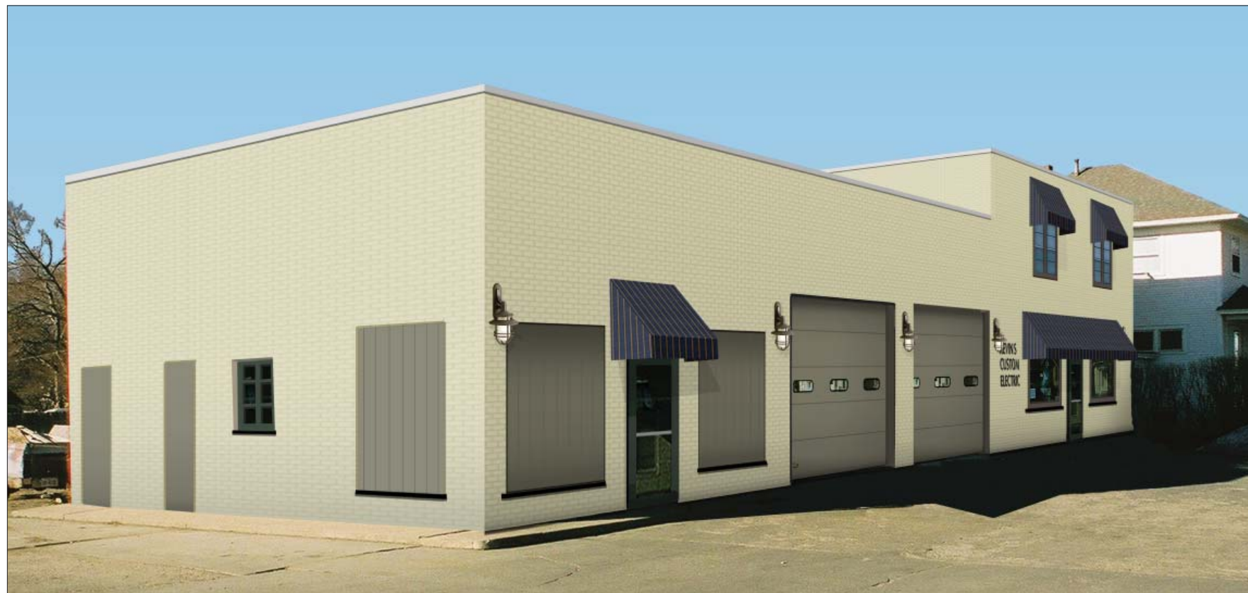
Image 17. Option 5 (Northeast Corner): This option varies from Options 3 and 4 in that the lighting fixtures are a wall mounted type attached lower on the facade, and the signage, constructed of cast metal letters, has been lowered in order to be illuminated by these lights. The infilled windows on the northeast corner of the building have been left blank. The light fixture is illustrated in Image 17.