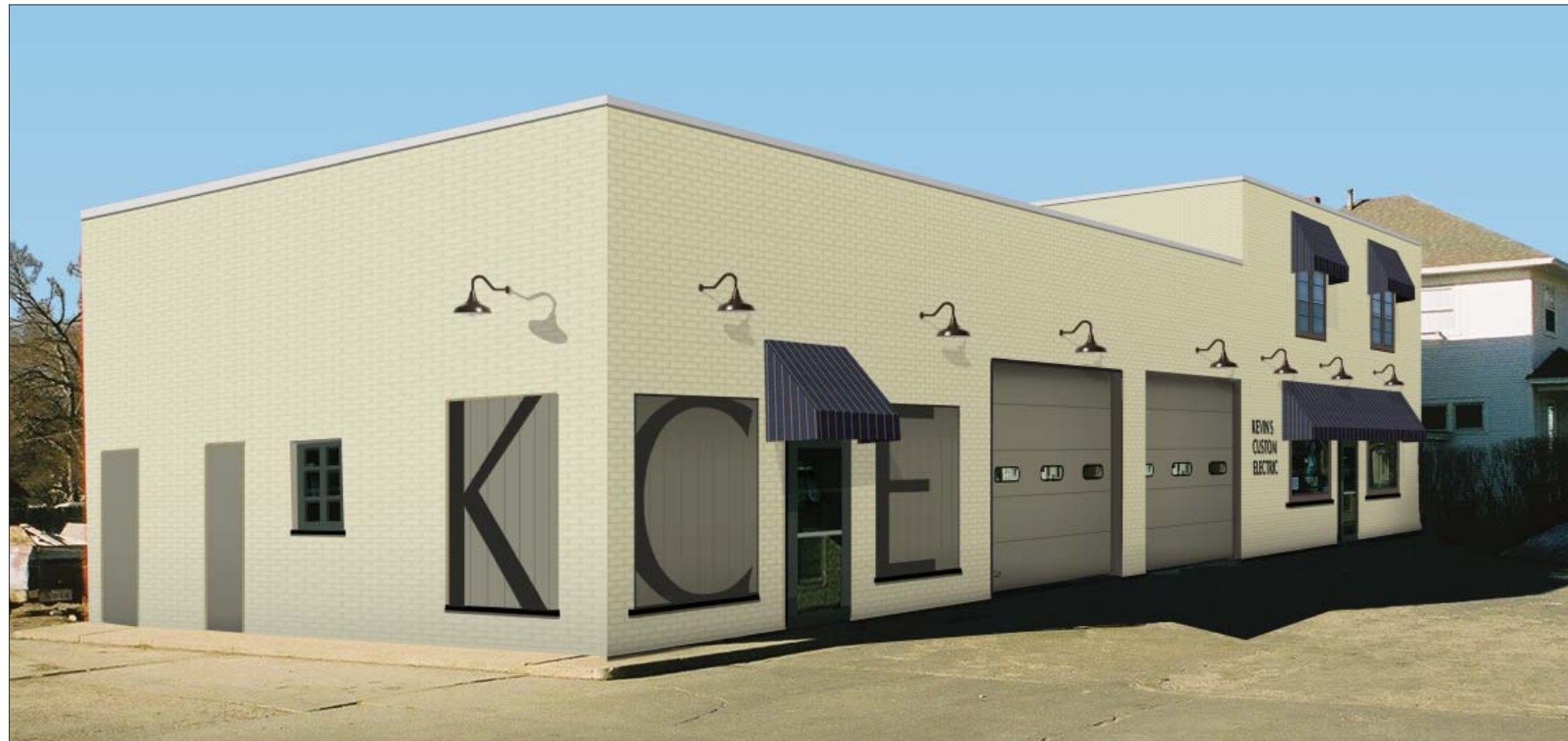
Image 11. Option 3 (Northeast Corner): New bronze window frames and doors are installed. A new garage door is installed, and, along with the remaining infilled windows and door openings, it is painted similar to the color "Bayberry" (#2205). The brick is painted similar to the color "Classic Gray" (#2201). Aluminum flashing is added along the top of the parapet wall. The three infilled windows on the northeast corner of the building have the capital letters "K, C, E" painted on them in the font style of the signage to represent an abbreviation of the business name. The gooseneck lamp is illustrated in Image 12, and the awning fabric is shown in Image 14.