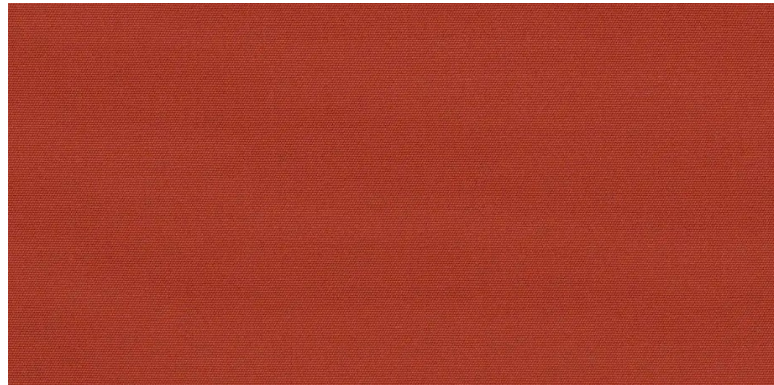
Sunbrella Terra Cotta