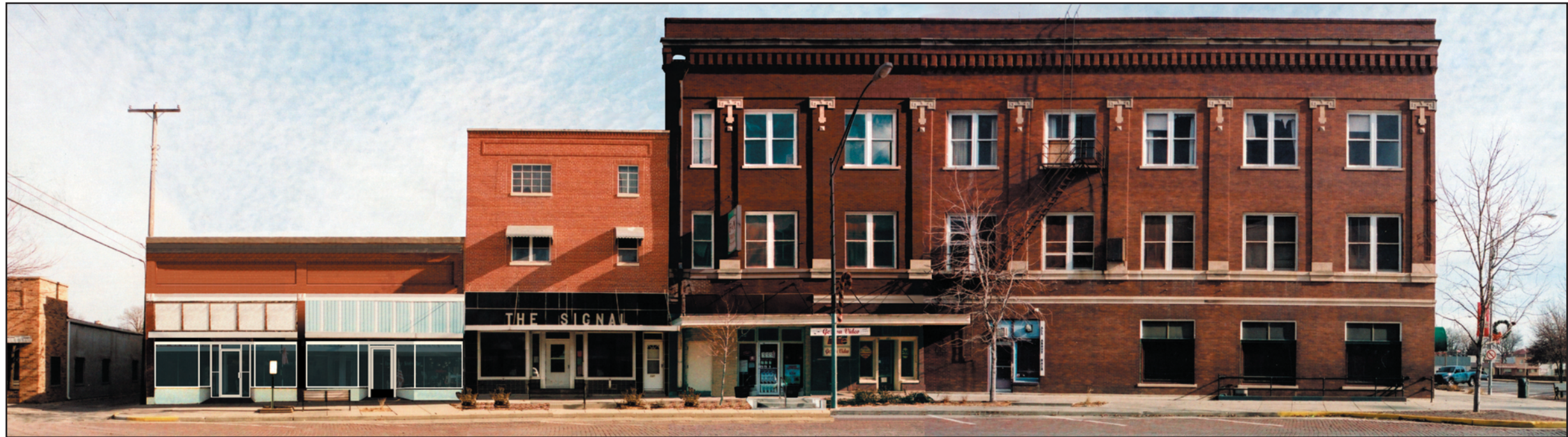
Image 1: A one-story brick building with two storefronts (to the left in this photo) adjoins the north side of The Nebraska Signal building on the east side of North 9th Street in Geneva. The building is adjacent to the mid-block alleyway. Transom windows in both storefronts were covered in previous remodeling of the building. To enhance visibility of the facade of this building, the existing tree in front of the building (see Image 2) is shown removed, even though that is not recommended as part of the proposals.