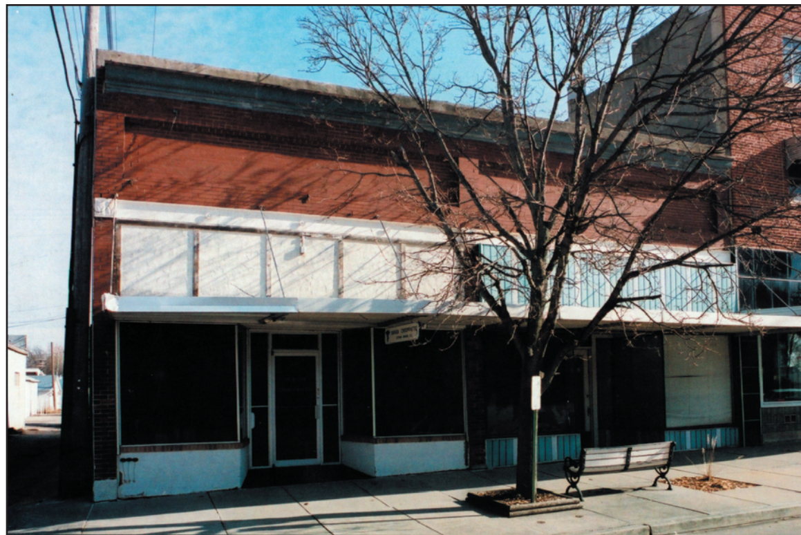
Image 2: The existing west facade has a metal canopy extending across both storefronts.