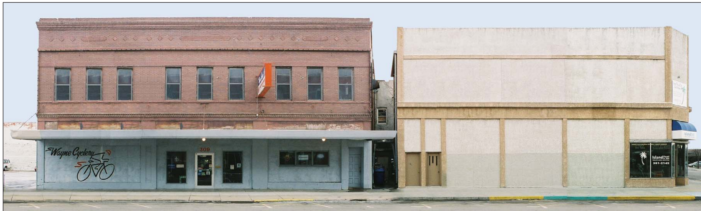
Image 2: Existing Condition. The Wayne Cyclery Building is located on the east side of the 300 block of Pine Street next to the Island Pool and Spa building.

These photographs show the historic and existing condition of the Wayne Cyclery Building. The first floor storefront portion of the building is painted light blue.