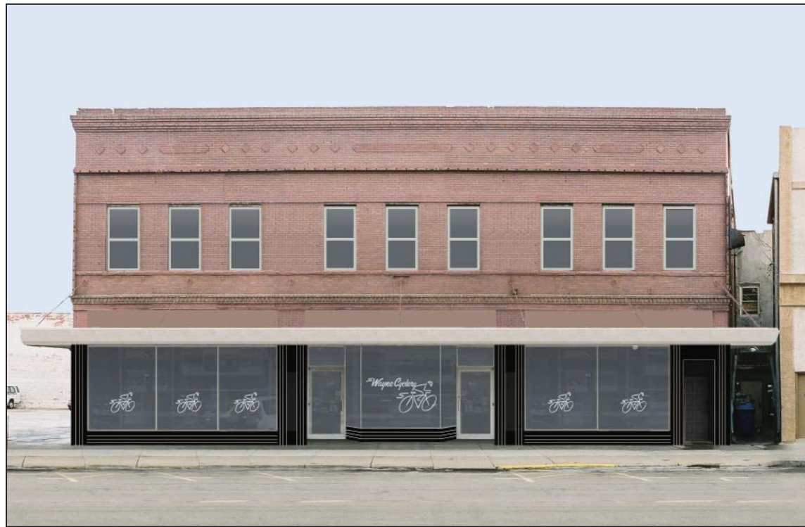
Image 5. Option 3. Otherwise similar to Option 1, black and off-white porcelain tile reminiscent of the tile used on the historic bus station facade has been used on the lower portion of the building's façade instead of stucco. Silver-colored window frames and door frames have been installed on all windows and doors. The awning and its supports are refinished to match the silver color of the window frames. The signage on the windows is similar to the current Wayne Cyclery logo.