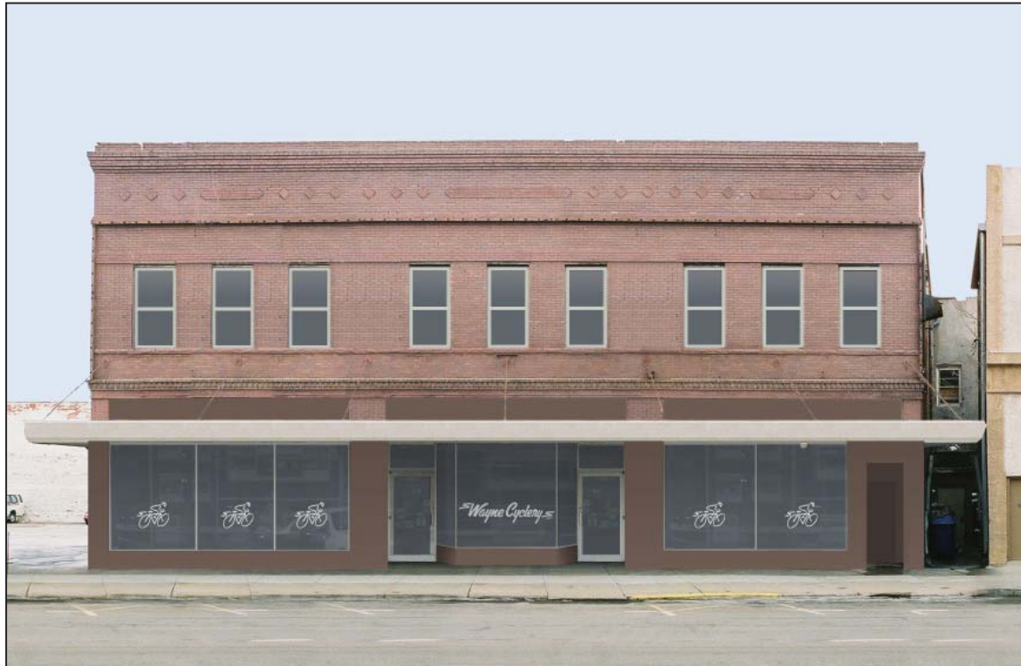
Image 7. Option 5. Otherwise similar to Option 1, silver-colored window frames and door frames have been installed. The awning and its supports are refinished to match the silver color of the window frames. The signage on the windows is similar to the current Wayne Cyclery font and logo.