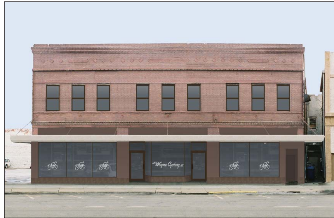
Image 6. Option 4. Otherwise similar to Option 1, the signage on the windows is similar to the current Wayne Cyclery font and logo.