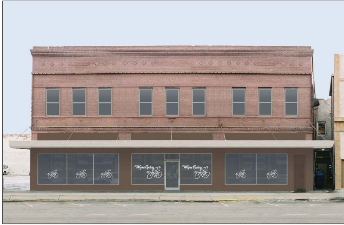
Image 13. Option 11. Otherwise similar to Option 2, a single door at the center of the façade provides entry. The signage on the windows is similar to the current Wayne Cyclery font and logo.