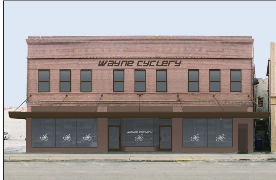
Image 8. Option 6. Otherwise similar to Option 1, the new sign on the upper portion of the building is composed of bronze-colored flat cut metal letters in "Bauer" font mounted to the brick façade.