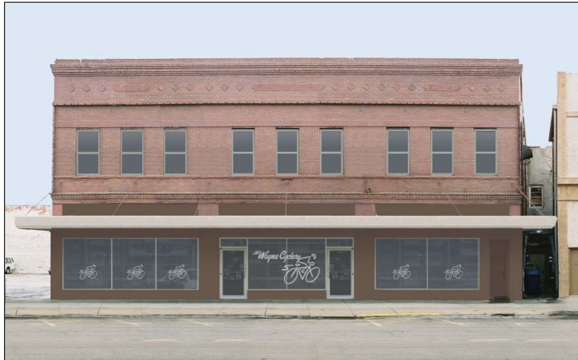
Image 15. Option 13. Otherwise similar to Option 2, two single doors at either side of the central bay portion of the façade provide entry. The signage on the windows is similar to the current Wayne Cyclery font and logo.