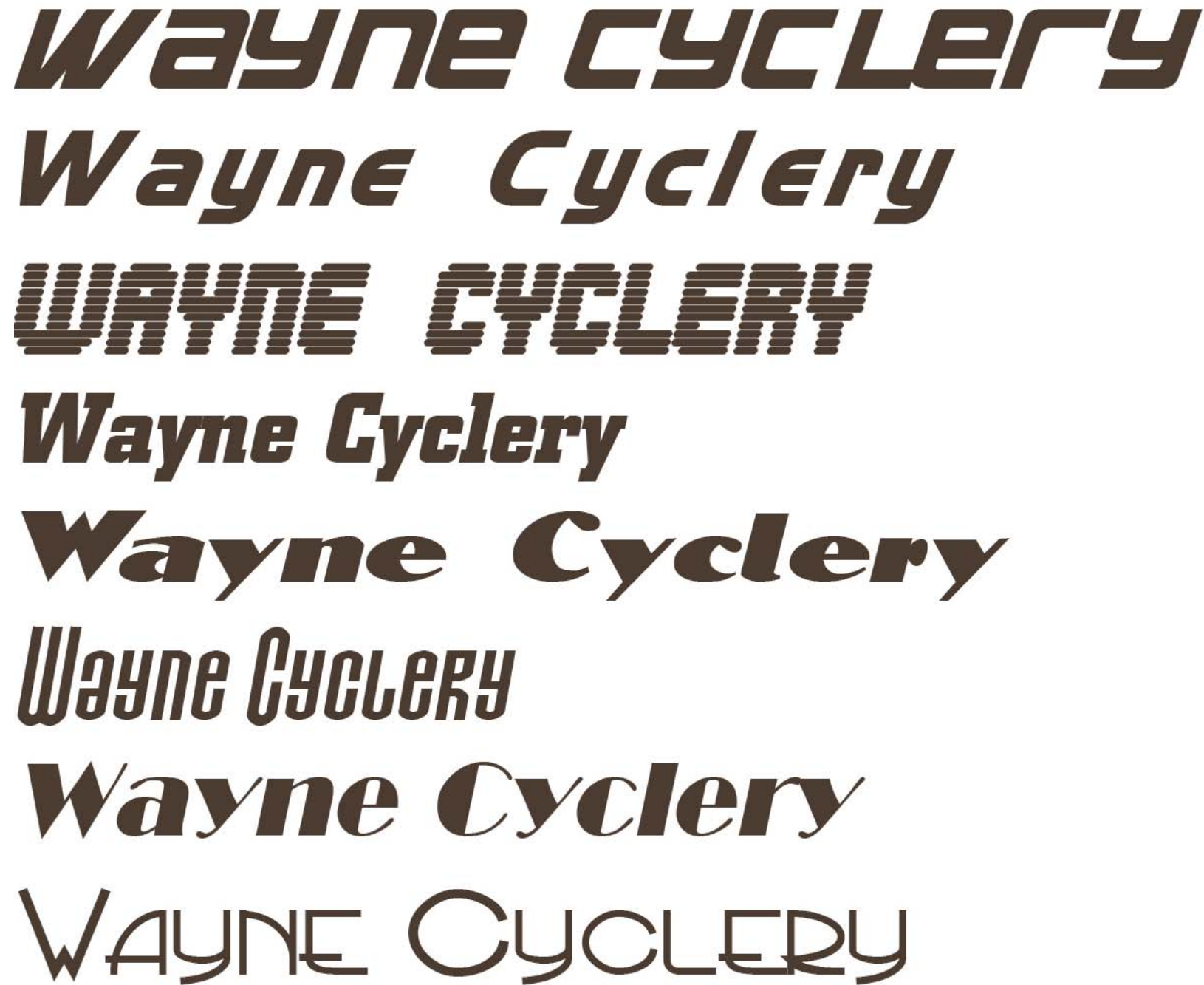
Image 17. A variety of font options could be used for signage on both the upper and lower portions of the building.