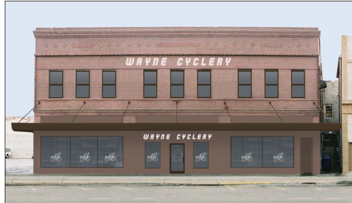
Image 12. Option 10. Otherwise similar to Option 7, bronze-colored window frames and door frames have been installed. The awning and its supports are refinished to match the bronze color of the window frames. The new sign on the upper portion of the building is composed of silver-colored flat cut metal letters in "Abduction2000" font, mounted to the brick façade. Signage on the lower portion of the façade uses "Abduction2000" font and the existing logo.

created by: NELMS Nebraska Lied Main Street • University of Nebraska College of Architecture