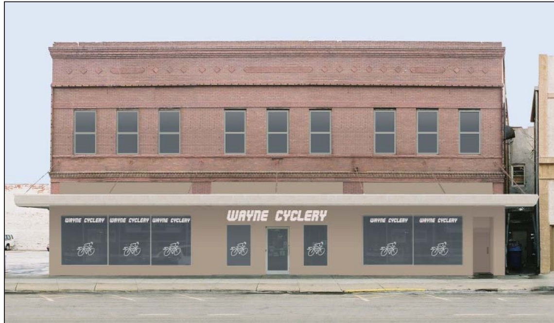
Image 11. Option 9. Otherwise similar to Option 7, the stucco on the lower portion of the building's façade is similar in color to Pratt & Lambert "Flax" paint color (#2048). Stucco of the same color has also been used above the canopy where clerestory windows once existed. Signage on the lower portion of the façade uses "Abduction2000" font and the existing logo.