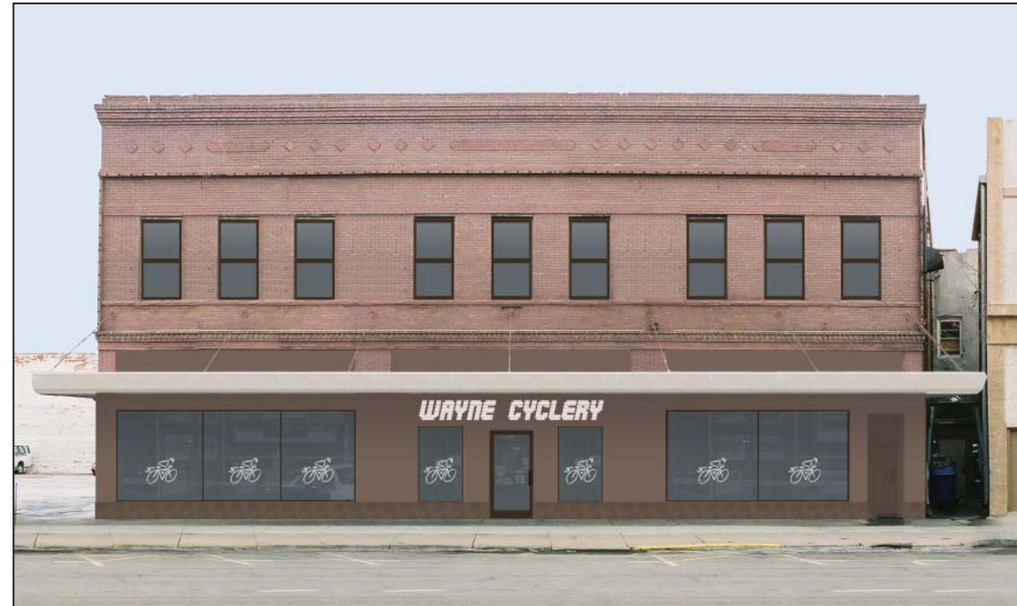
Image 10. Option 8. Otherwise similar to Option 7, bronze-colored window frames and door frames have been installed. Signage on the lower portion of the façade uses "Abduction2000" font and the existing logo. The single course of 12"x12" porcelain tile installed at the base of the building is similar to American Olean "Brownstone".