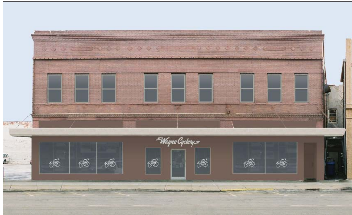
Image 9. Option 7. The configuration of the storefront is similar to the existing Wayne Cyclery storefront. The stucco used on the lower portion of the building's façade is similar in color to Pratt & Lambert "Stetson" paint color (#2038). Stucco of the same color has also been used above the canopy where clerestory windows once existed. All storefront windows have been replaced. Silver-colored window frames and door frames have been installed. The awning and its supports are refinished to match the silver color of the window frames. The signage on the lower portion of the façade is similar to the current Wayne Cyclery font and logo.