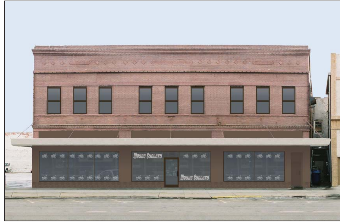
Image 14. Option 12. Otherwise similar to Option 2, a single door at the center of the façade provides entry. Bronze window frames and door frames have been installed on all windows and doors. The single course of 12"x12" porcelain tile installed at the base of the building is similar to American Olean "Brownstone". Signage on the lower portion of the façade uses "Do Not Eat This Skew" font and the existing logo.