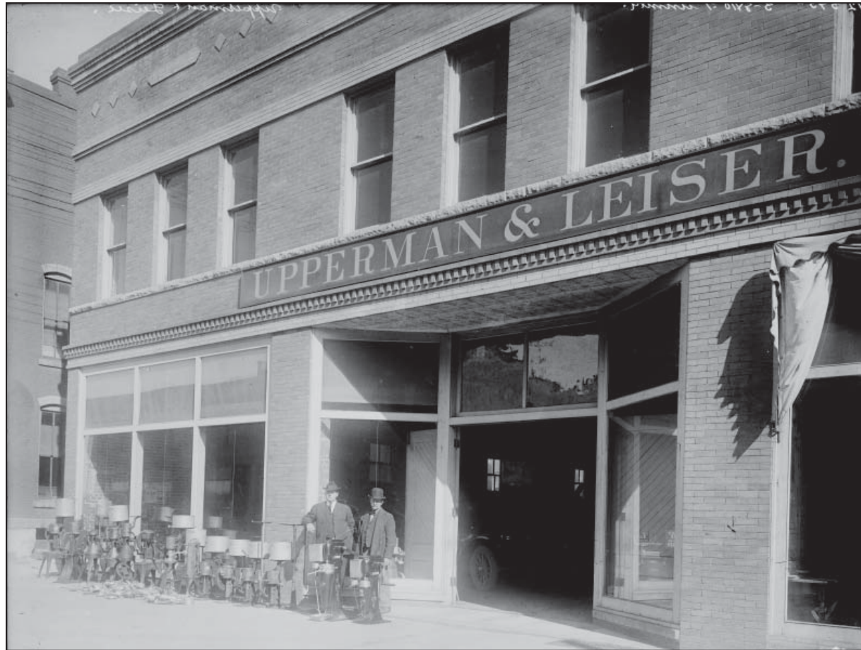
Image 1: Historical Photograph. In this early photograph of the present Wayne Cyclery building, all parts of the original façade—including second story windows, transom windows, and storefront windows—are intact. The existing canopy was added later, and the entry was reconfigured. The building is shown to have been the Upperman & Leiser store.