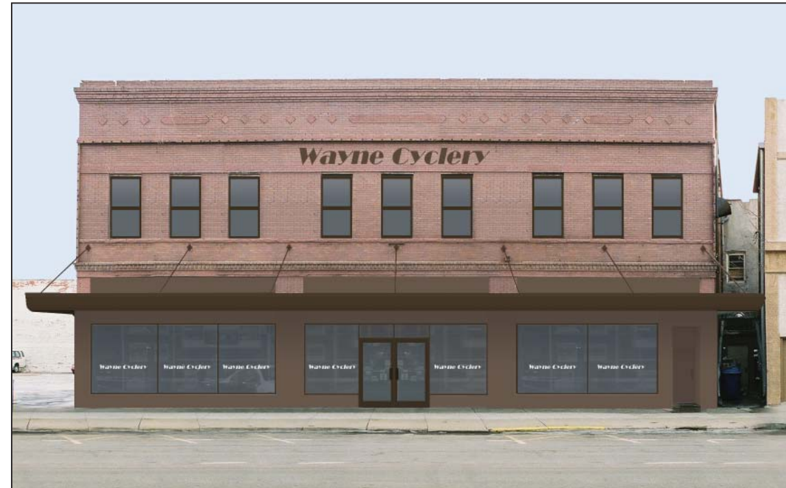
Image 16. Option 14. Otherwise similar to Option 2, bronze-colored window frames and door frames have been installed. The awning and its supports are refinished to match the bronze color of the window frames. The new sign on the upper portion of the building is composed of bronze-colored flat cut metal letters in "New York Deco" font, mounded to the brick façade. Signage on the lower portion of the façade uses "New York Deco" font and the existing logo.