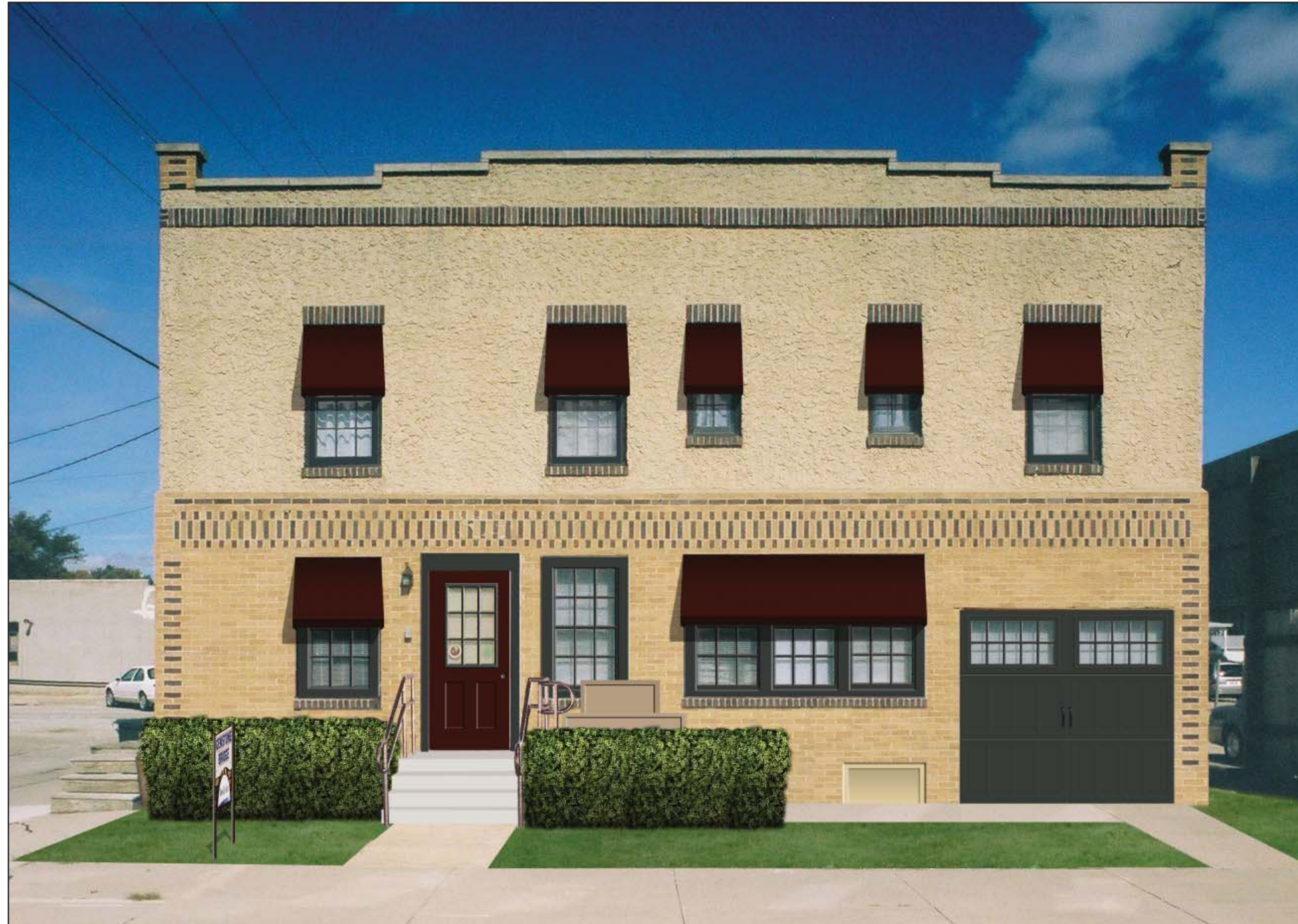
Image 1. Option 1. All window and door frames are painted with Pratt & Lambert's "Fedora" (2041) paint. The garage door is similar to the Amarr Garage Door's Northampton door with Madiera Windows. The garage door is painted to match the window and door frames. The signage has been removed from the facade, and a new sign is placed near the entrance. The door is painted to match the Sunbrella fabric "Mahogany" (4667), which is used on new upper and lower story window awnings. A wheelchair lift is installed adjacent to the stair. This option saves space and allows more of the refinished facade to be appreciated.