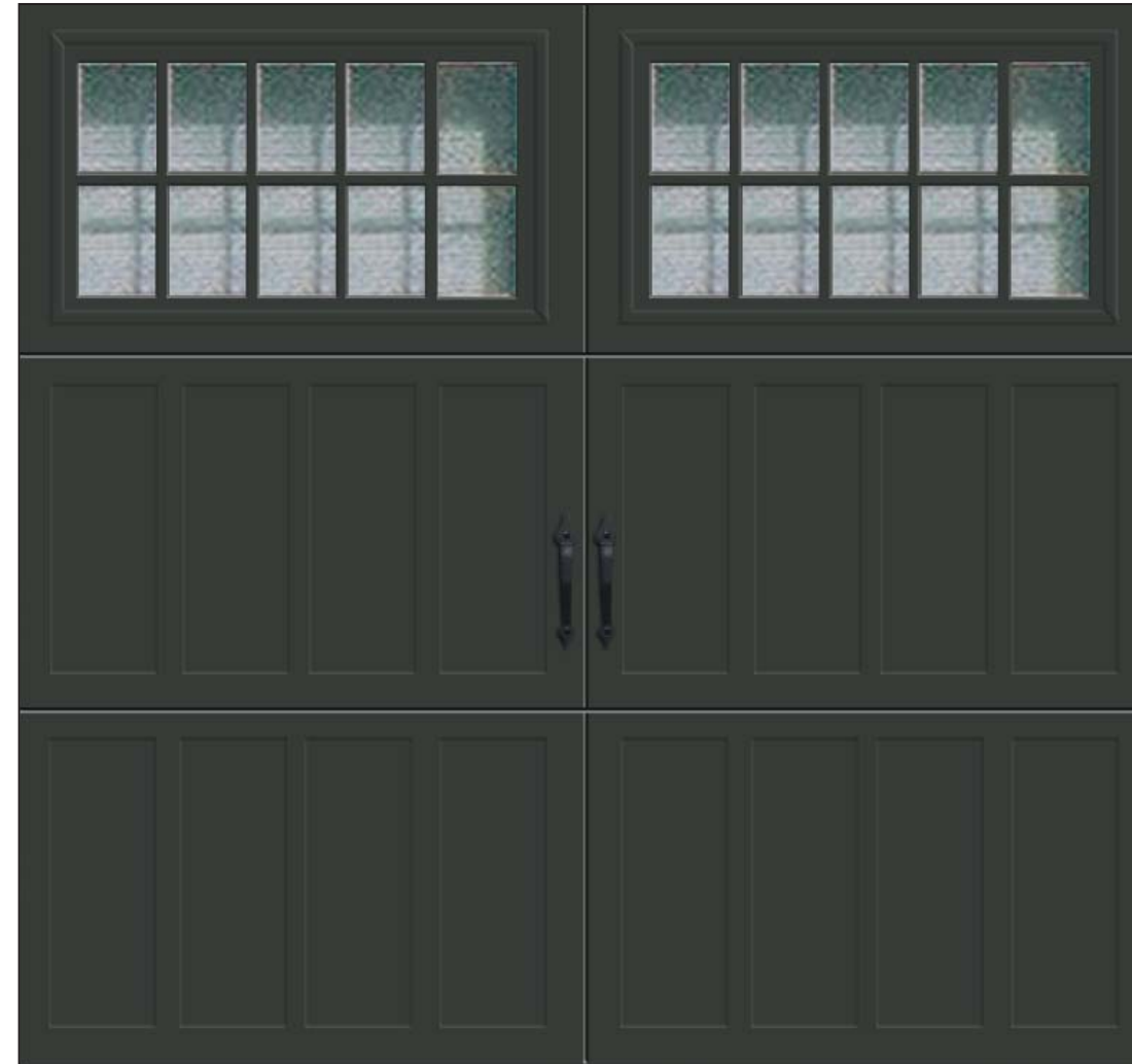
Image 9. The garage door is similar to the Amarr Garage Door's Northampton door with Madiera Windows. The door is painted with a high-quality latex exterior paint to match Pratt & Lambert's "Fedora" (2041).