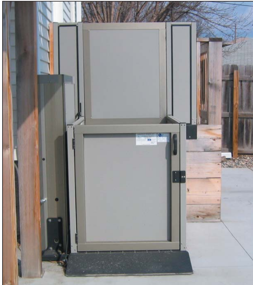
Images 7 and 8. The platform wheelchair lift proposed for Gemstone Bridge would be similar to this installation located elsewhere.