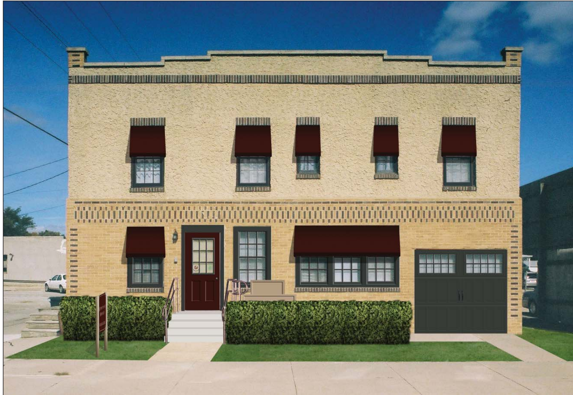
Image 4. Option 2. The same facade adjustments have been made in this option as in Option 1. The shrubs have been extended and a new more substantial sign with new graphics installed near the entrance.