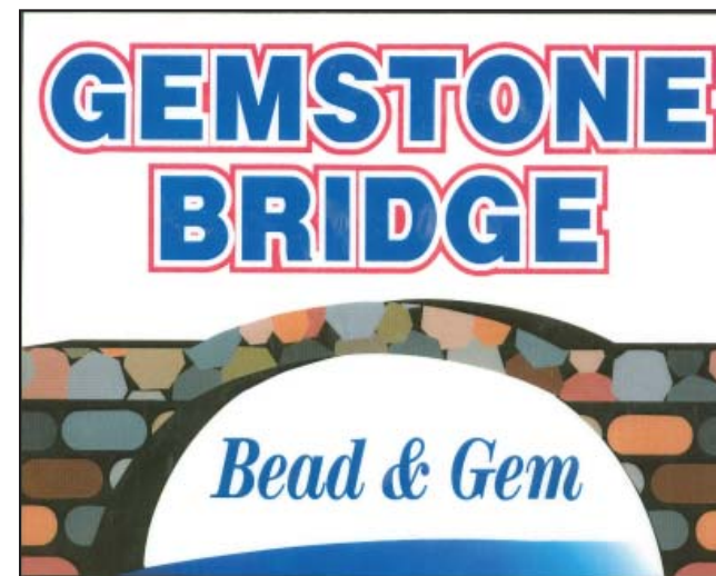
Image 3. Existing Gemstone Bridge Sign