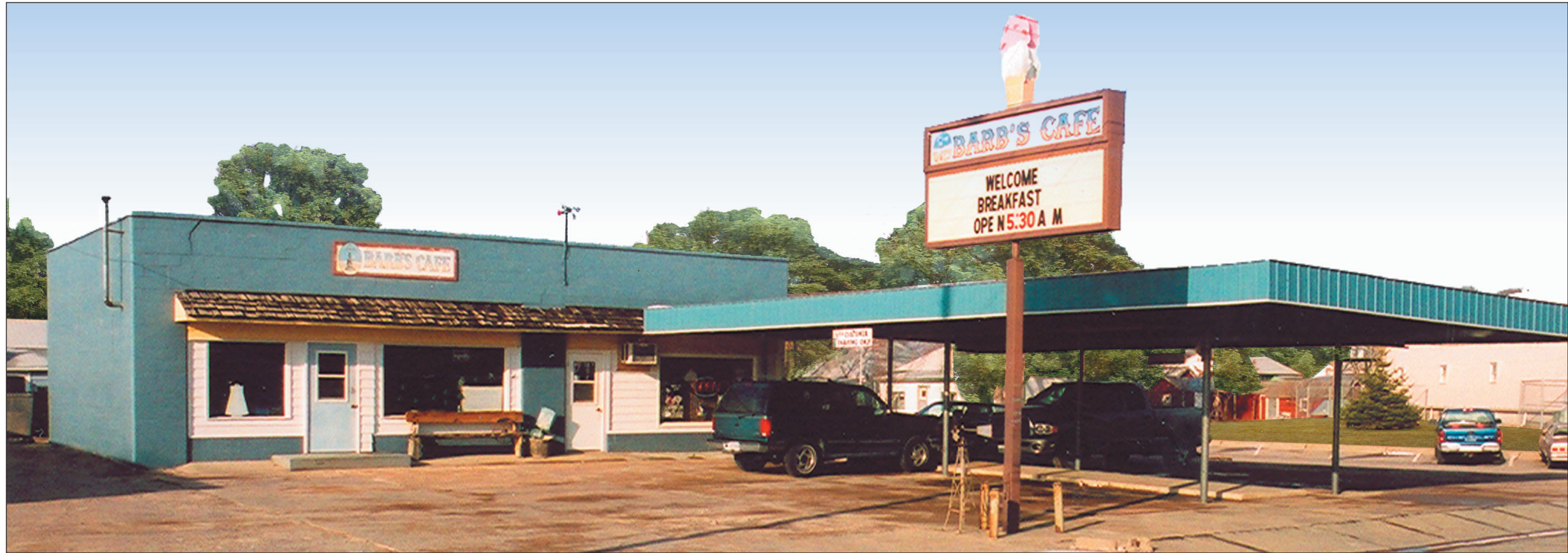
Image 3. Existing condition. Southwest corner.