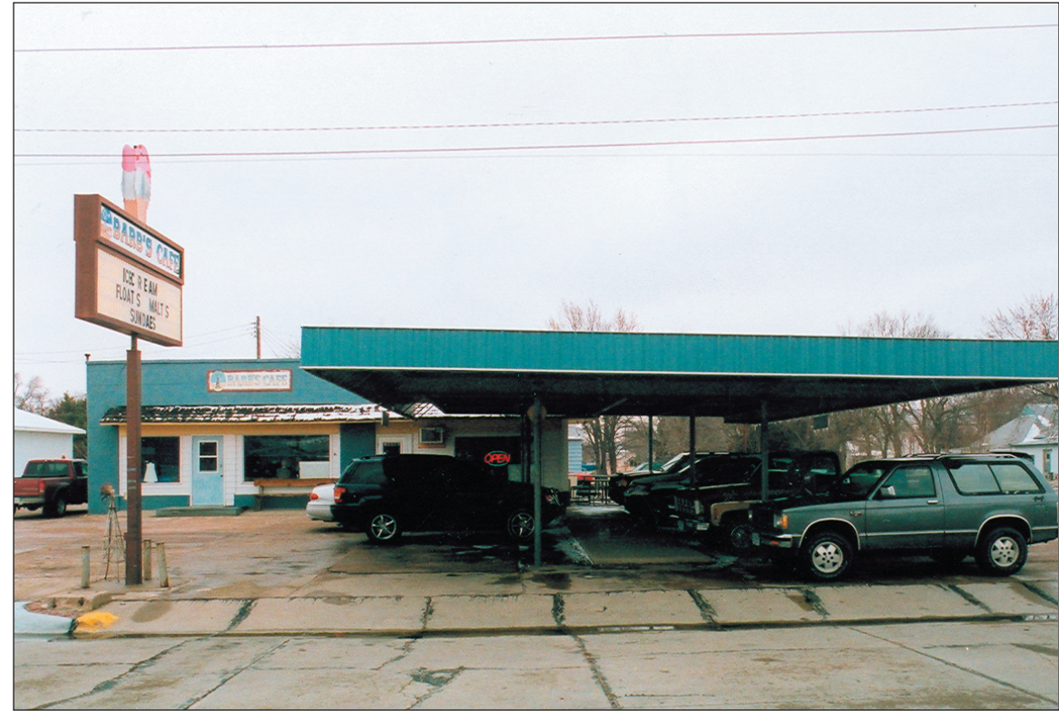
Image 2. Existing condition. South facade.