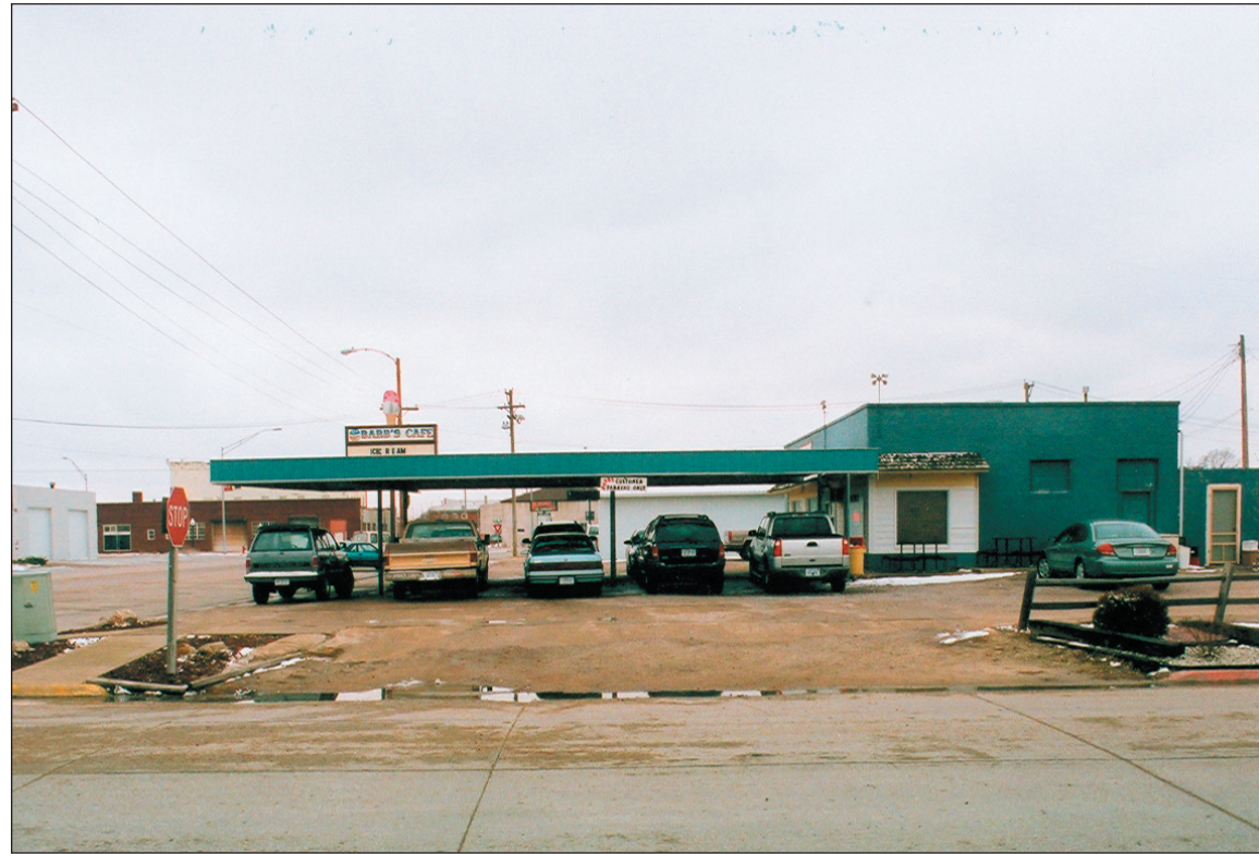
Image 1. Existing condition. East facade.